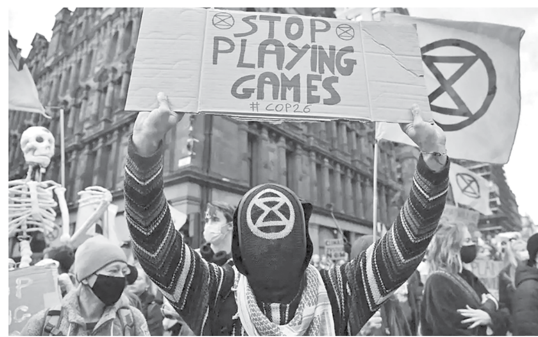
Climate activists march through the streets of Glasgow during COP26.