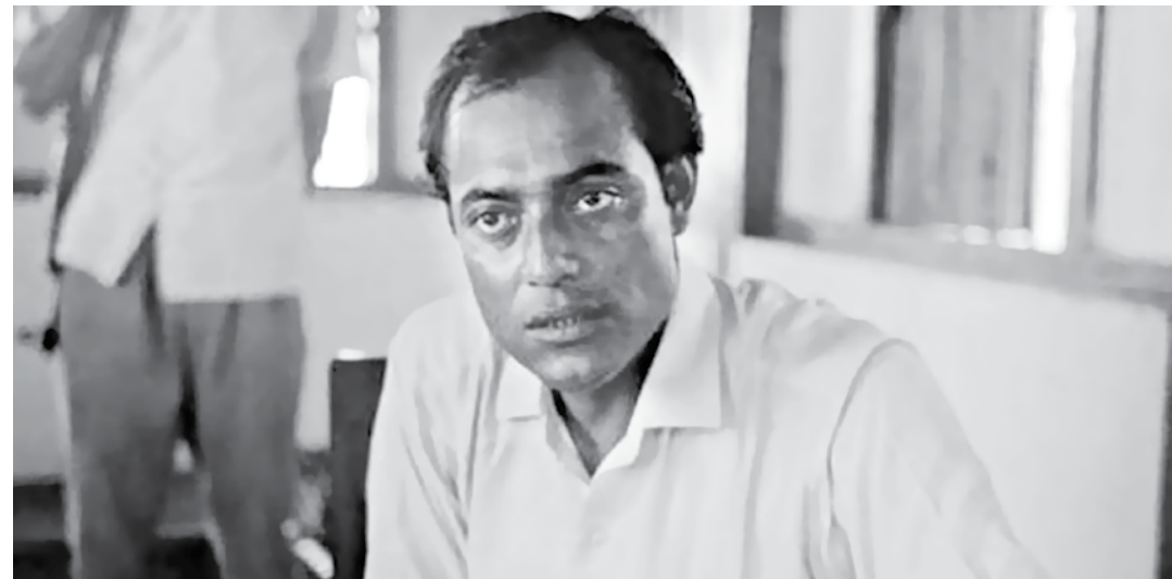
Major General Khaled Mosharraf, Bir Uttom (1937-1975)

Mahjabeen Khaled is a Member of Parliament and the daughter of Major General Khaled Mosharraf Bir Uttom.