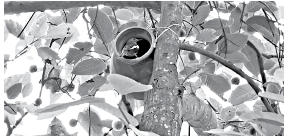
A wagtail is seen peeping through a nest made of earthen pitcher at Khalisha Belpukur village in Nilphamari's Saidpur upazila. Hundreds of such nests are installed in a bid to increase bird populations.

Deputy Commissioner of Nilphamari Hafizur Rahman Chowdhury said, "We've taken steps to set up a wildlife rescue and treatment centre in Saidpur soon."