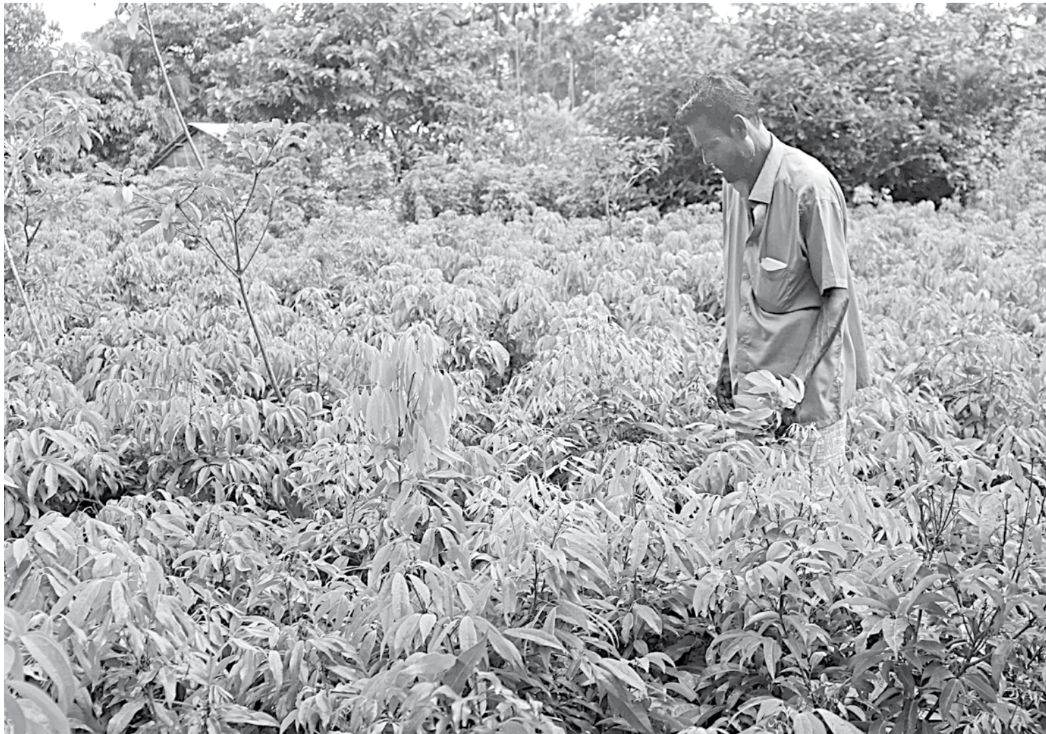
A tree nursery in Paschim Kuniari village in Pirojpur's Nesarabad upazila.