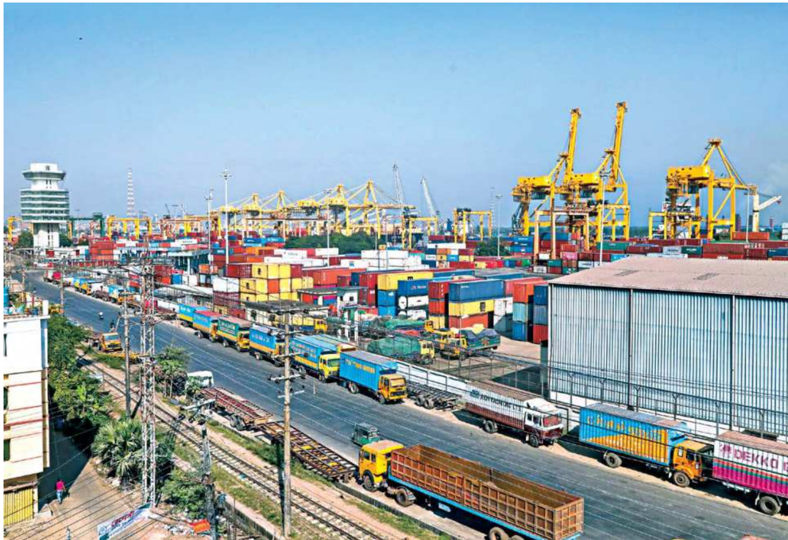
Lorries (also known as covered vans) lie idle by the boundary wall of the Chattogram port yesterday as a countrywide transport strike over a fuel price hike continued for the second day. This has almost brought to a halt the port's deliveries of imported goods as well as container transport between the port and private inland container depots.