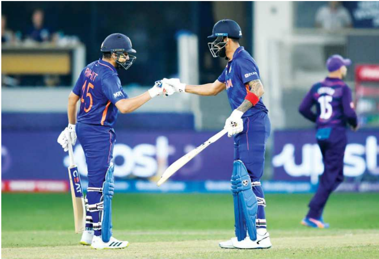
India's Rohit Sharma (L) and KL Rahul bump their fists after a boundary during their T20 World Cup fixture against Scotland at the Dubai International Cricket Stadium on Friday. India romped to an eight-wicket victory against the Scots, keeping their slim chances of a semifinal berth alive. For more see page 14.