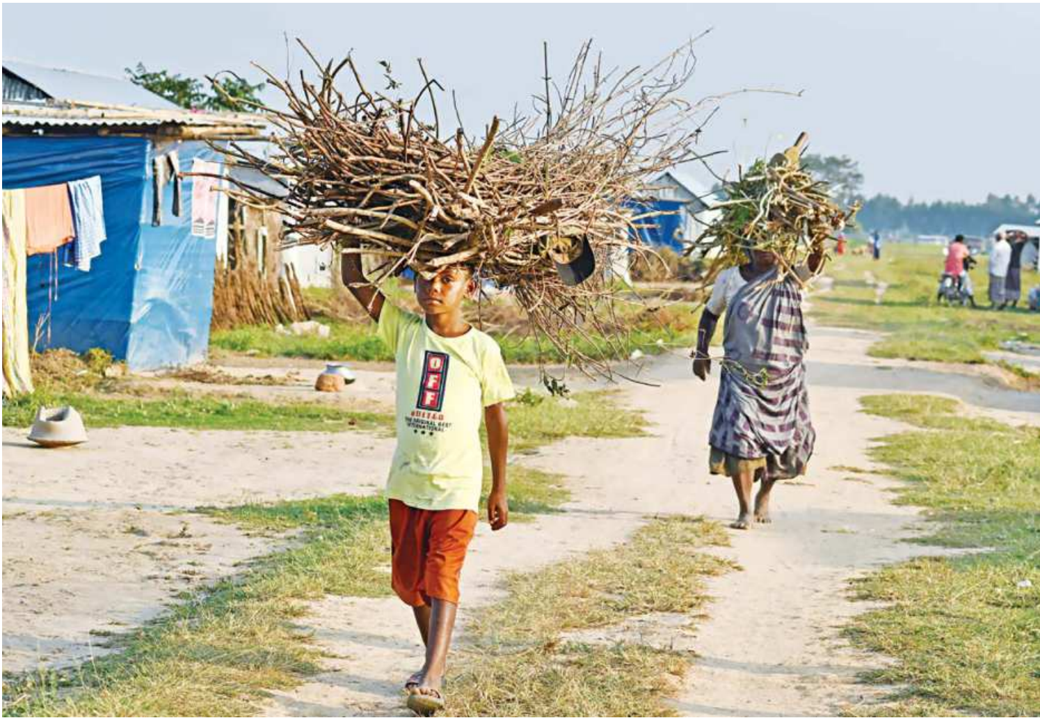
A boy and a woman of the Santal community carrying firewood near Joypurpara village in Gobindaganj, Gaibandha. They are from the nearly 1,500 Santal and Bangali families facing homelessness as the government plans to build an export processing zone on over 1,800 acres of land in the area.