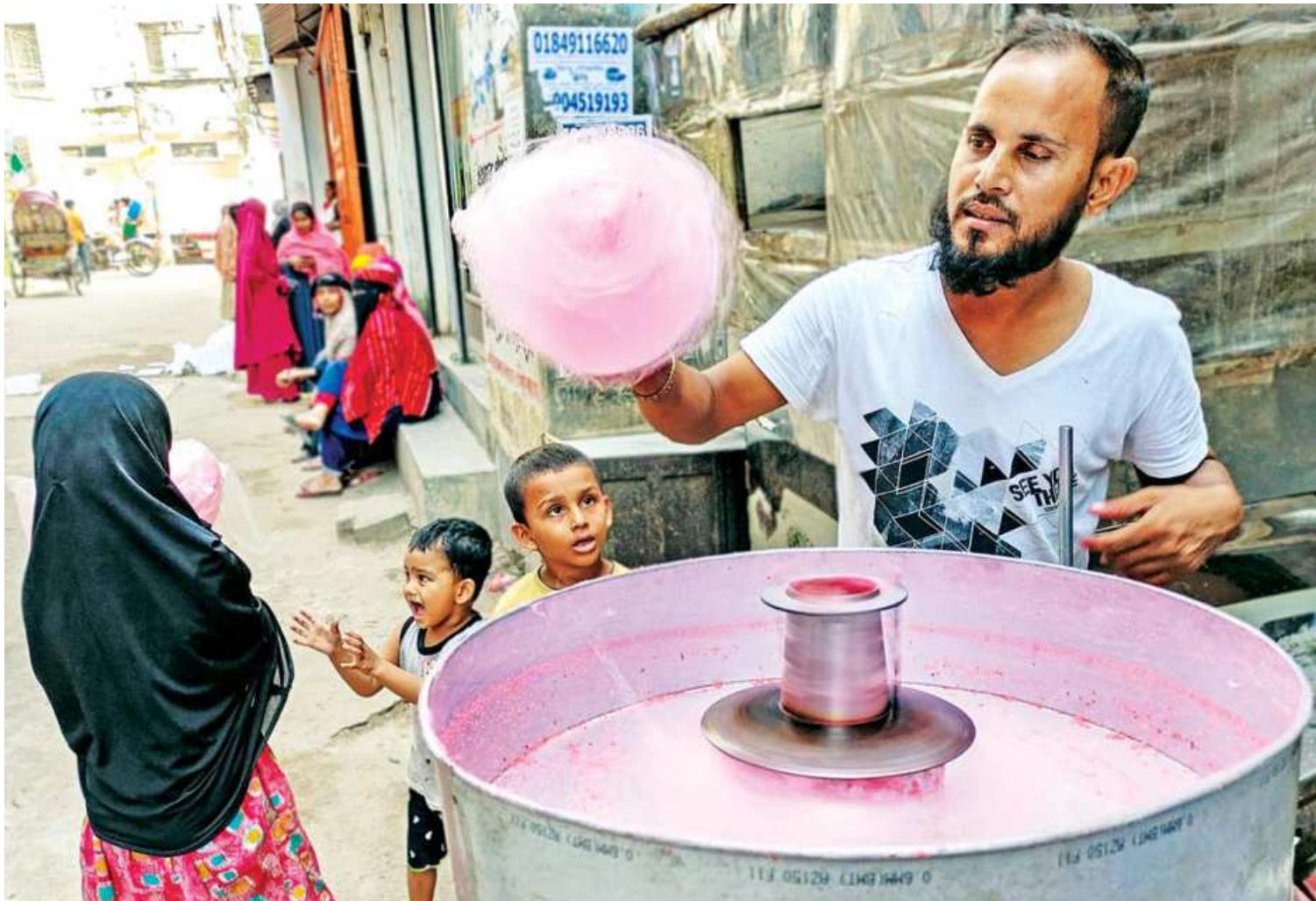
A child, wide-eyed with eagerness, waits for his cotton candy at a vendor's stand in the capital's Hazaribagh area. As locals there are mostly poor, vendors usually use toxic colours to make cheap, low-quality cotton candy, which can be harmful for one's health. The photo was taken yesterday.