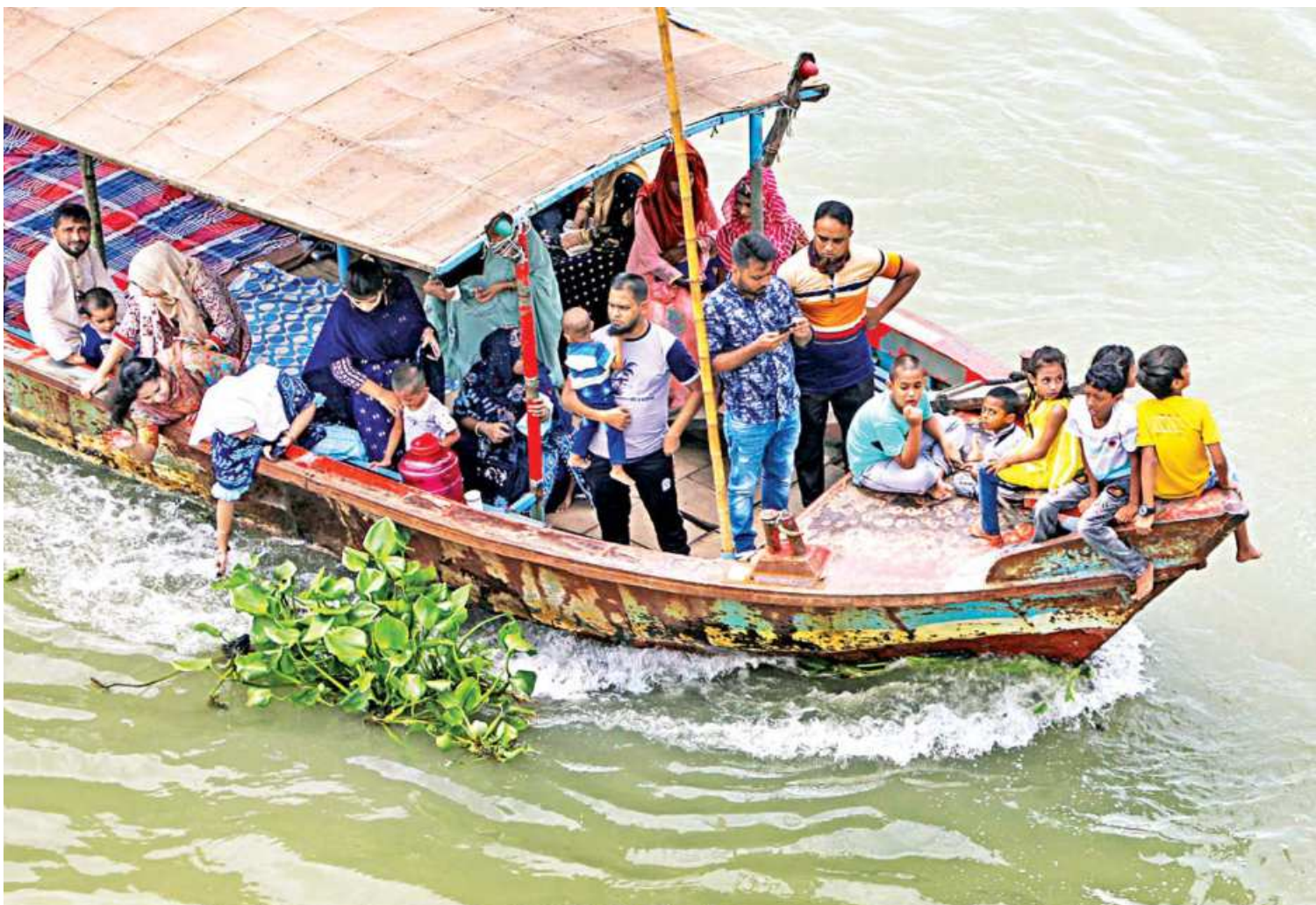
At least six children sit huddled together on the bow of a speedboat, dangerously close to the water, while guardians stand nonchalantly behind them. Such carelessness by parents could result in tragic accidents. The photo taken on the capital's Gabtoli bridge over the Turag.

SHARIFUL ISLAM Eight out of every 10 militants, arrested in about the last two decades, were from the northern districts and dragged into militancy by their poor socioeconomic status and religious bigotry, reveals a police study. The report, prepared by Anti-Terrorism Unit (ATU), a police unit dedicated to combat militancy, finds that 80 percent of militants are from general education background while the rest from madrasas. The study, first of its kind in Bangladesh, has detailed information on the rise and spread of militancy, age of militants, their income group and how they got into militancy. It has also made some observations and recommendations. According to the study, the highest number of militants are from the age group of 31-40. Militant outfits recruit a significant number of their operatives by "misinterpreting religion" and using online platforms. Formed in 2017 as the lead coordinating, operating and investigating body to fight extremism, ATU prepared the report analysing data on 1,217 militants, arrested in connection with terrorism related cases filed between 2001 and 2020 in three metropolitan cities and eight divisions. They are members of Harkat-ul-Jihad Al Islami Bangladesh (Huji-B), Jama'atul Mujahideen Bangladesh SEE PAGE 5 COL 1