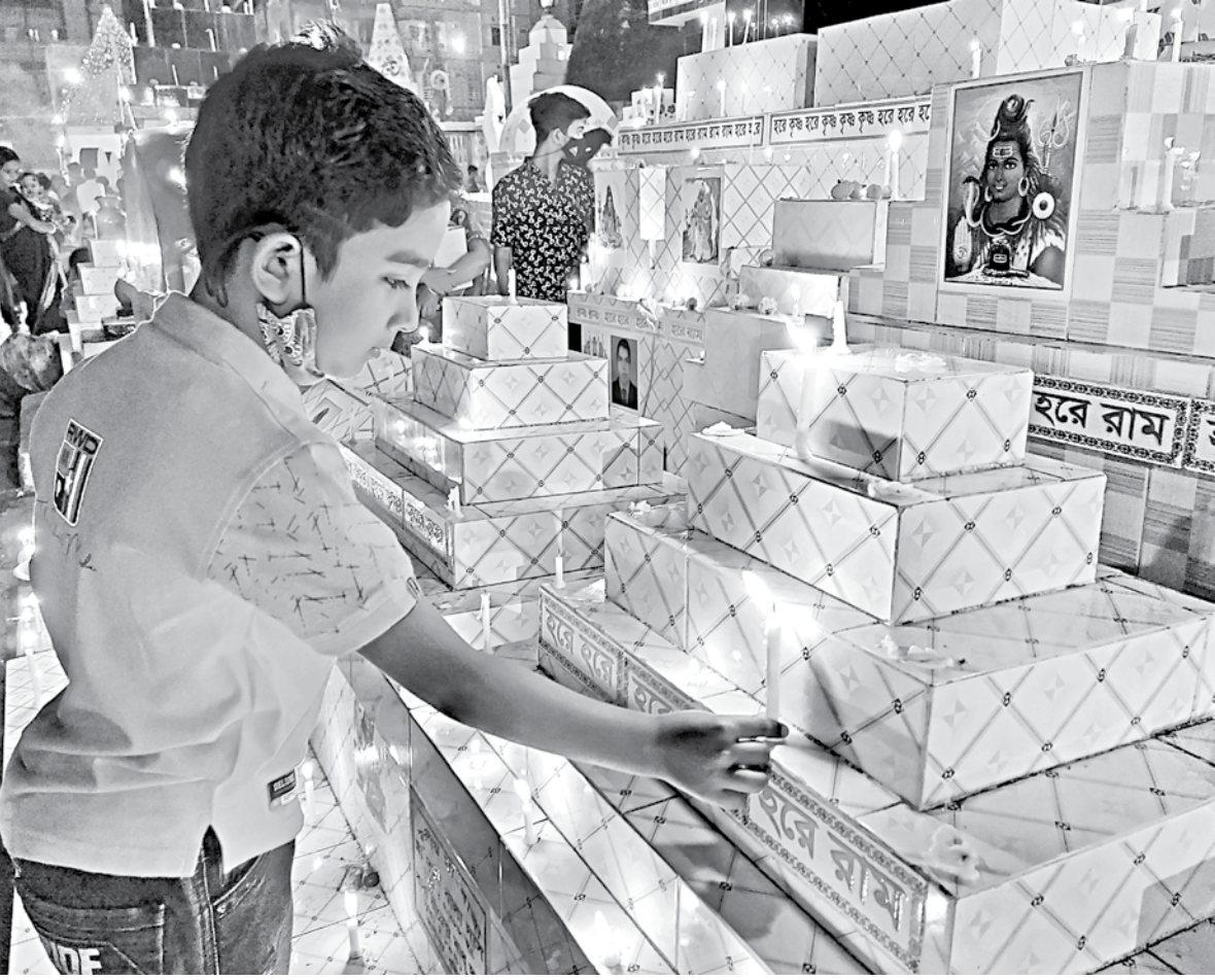
Barishal city's Maha Shamshan played host to the Maha Shamshan Dipabali ceremony yesterday. With special prayers before and on the night of Kali Puja, relatives seek blessings for the departed souls of near and dear ones on the occasion.

Among the deaths, 86 died in Dhaka, two in Chattogram, two each in Khulna and Mymensingh, and one each in Rajshahi and Barisal. This is the second highest number of dengue deaths in the country since the first outbreak in 2000. The highest 179 died in 2019 and 93 in 2000.