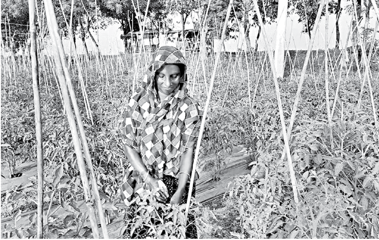
A farmer tends to a summer tomato plant at her farm in Teliaparabazar area under Madhabpur upazila of Habiganj.

Meanwhile, a similar programme was observed in Moheshkhali municipality as a case was lodged against municipal Mayor Maksud Miah with Moheshkhali Police Station on October 25 over occupying and looting a shrimp enclosure.