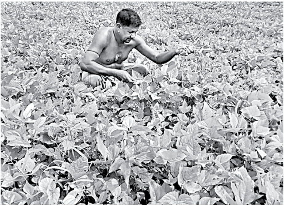
A farmer attends to his black gram (mashkalai) cultivation in Chaugachha upazila of Jashore.

"We have been cooperating and imparting training to the farmers for the cultivation of the crops," he said.