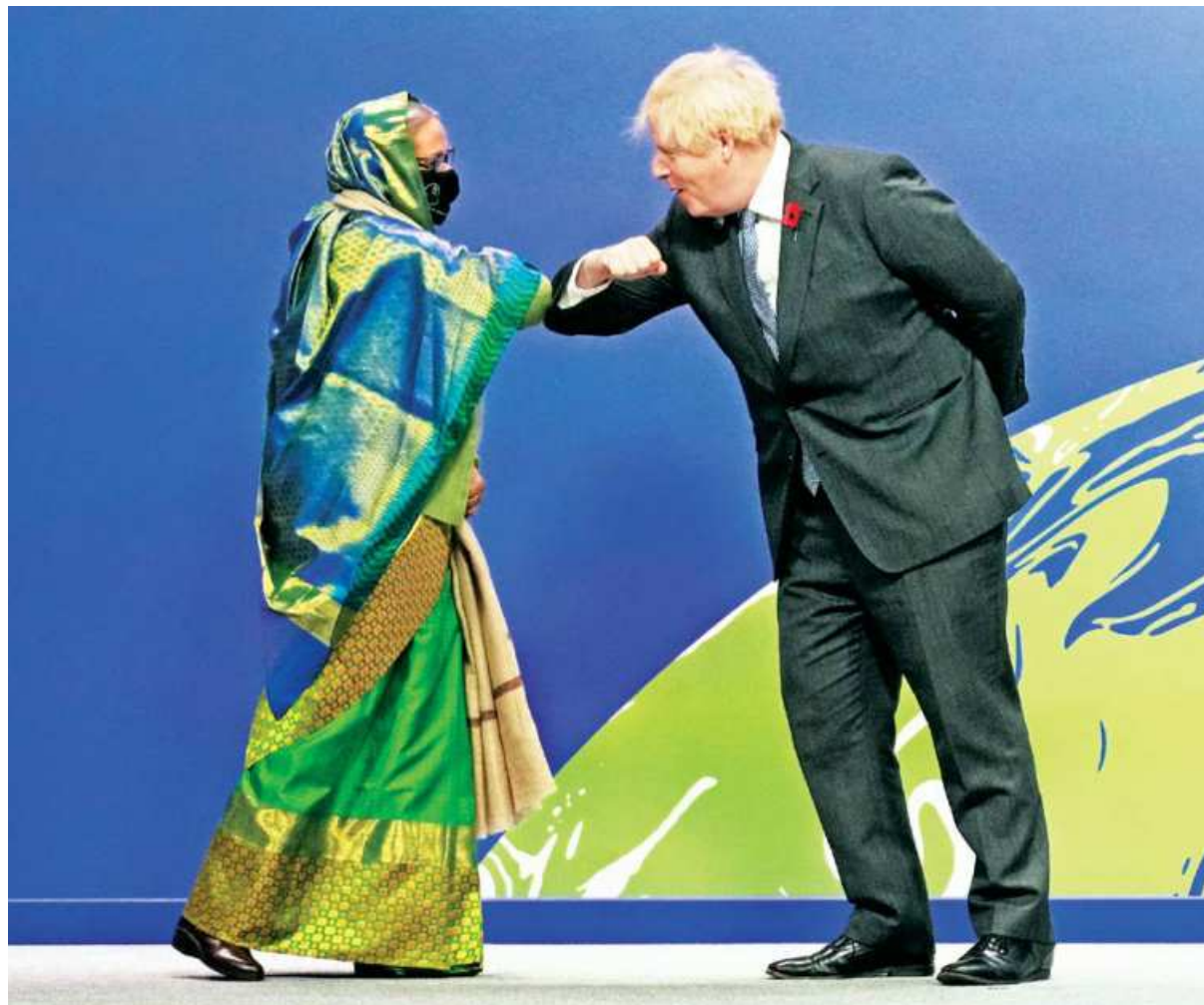
Prime Minister Sheikh Hasina is greeted by her British counterpart Boris Johnson during arrivals at the UN Climate Change Conference in Glasgow, Scotland, yesterday.