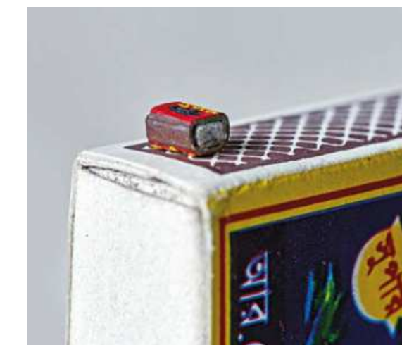
The tiny speck that you see is the world's smallest matchbox