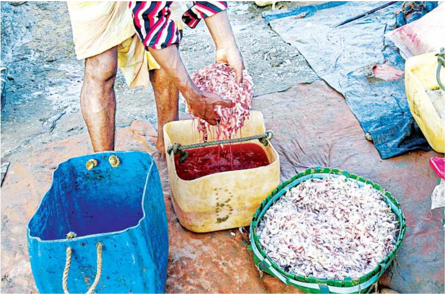
Shrimp being soaked in water mixed with artificial colouring, which is meant to be applied on fabric and is harmful when ingested by humans. This unethical and hazardous method of changing the colour of shrimp to attract customers is going on at the Fishery Ghat Natun Bazar in Chattogram city. This photo was taken on Saturday morning.

‘The last, best hope’ Says COP26 chief on climate summit; G20 agrees on 1.5C target but falls short of a pledge on zero emissions AGENCIES The United Nations Climate Change Conference (COP26) began in the Scottish city of Glasgow yesterday as world leaders gather amid calls to avert climate disaster. COP26 climate negotiations are the “last, best hope” to keep the goal of limiting global warming to 1.5C alive, said summit president Alok Sharma as he opened the meeting. The Glasgow gathering, which runs to November 12, comes as an accelerating onslaught of extreme weather events across the world underscores the devastating impacts of climate change from 150 years of burning fossil fuels. “We know that our shared planet is changing for the worse,” said Sharma at the opening ceremony. G20 leaders meeting in Rome yesterday committed to the key goal of limiting global warming to 1.5 degrees Celsius and pledged action on the use of coal, but fell short on a target of zero emissions, according to a final draft communiqué. Experts warn that only transformative action in the next ten years will help stave off far more cataclysmic impacts. And the warming of the planet did not pause for the Covid-19 pandemic, which caused the UN meeting to be delayed by a year. COP26 inherits its central goal from the landmark 2015 Paris Agreement, which saw countries agree to cap global SEE PAGE 5 COL 2