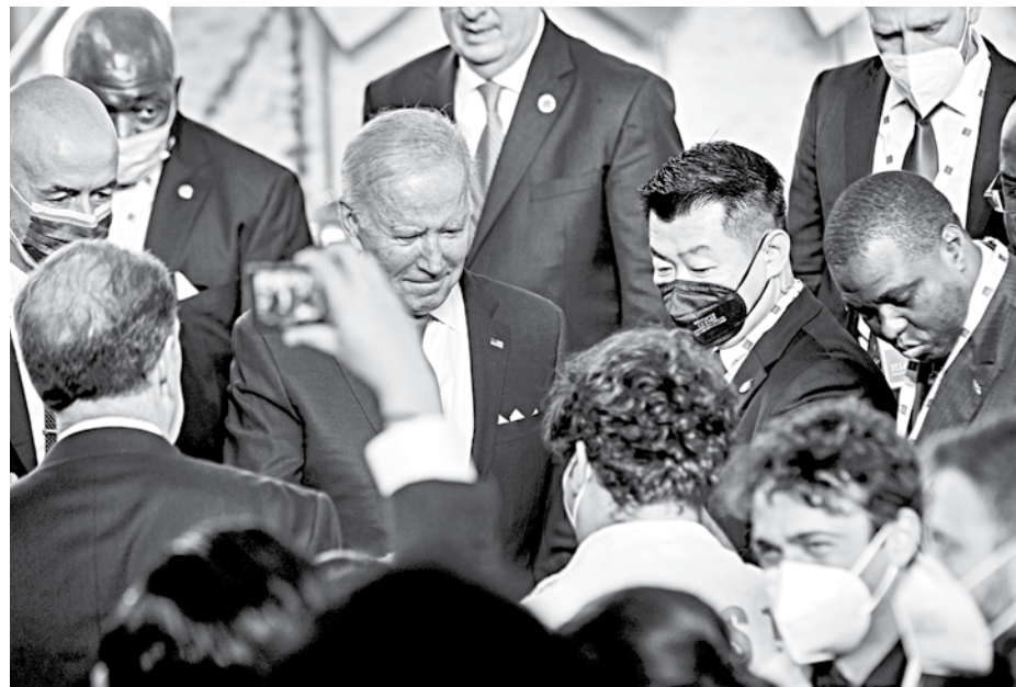
US President Joe Biden is seen after the group photo at the G20 summit at the La Nuvoletta in Rome yesterday.

"There are major energy producers that have spare capacity, and we're encouraging them to use it to ensure a stronger, more sustainable recovery across the world," the official said, without naming any specific countries.