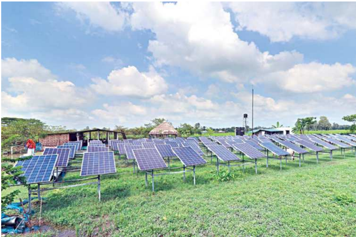
A solar irrigation facility at Nizpara village in Dinajpur's Birganj upazila. Farmers in the remote village where electricity is yet to reach get the water supply thanks to the solar-run system to irrigate their land.