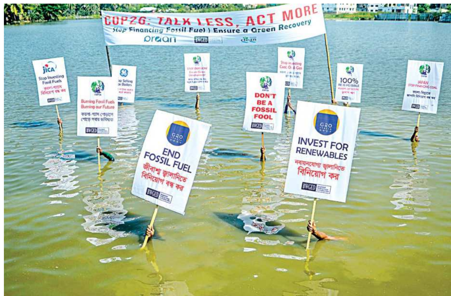
Climate protesters take part in a demonstration calling upon world leaders to take action to cut carbon emissions yesterday, ahead of the COP 26 United Nations Climate Change Conference in Glasgow. This photo was captured from Khulna's Boyra area. Story on page 4.