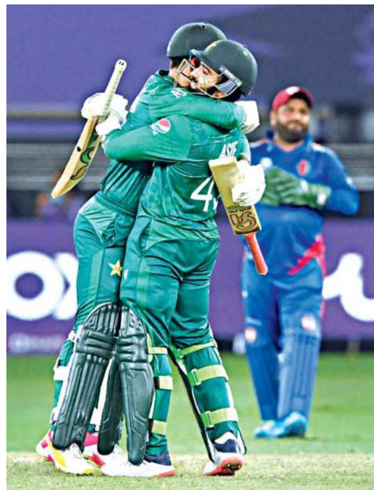
Pakistan's Shadab Khan (L) embraces Asif Ali after the latter hit four sixes in the penultimate over from Afghanistan pacer Karim Janat to seal a five-wicket victory in their Super 12 match of the ICC Twenty20 World Cup at the Dubai International Cricket Stadium on Friday.