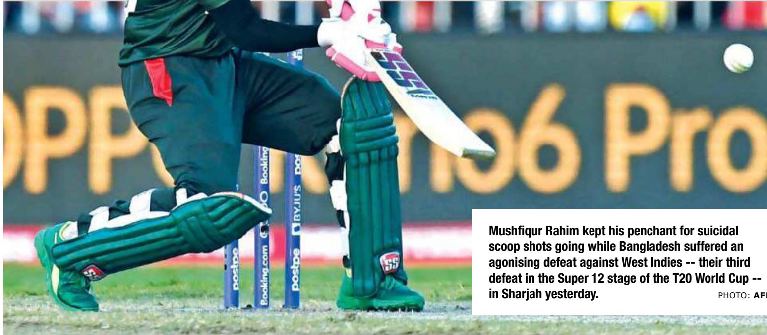
Mushfiqur Rahim kept his penchant for suicidal scoop shots going while Bangladesh suffered an agonising defeat against West Indies -- their third defeat in the Super 12 stage of the T20 World Cup -- in Sharjah yesterday.