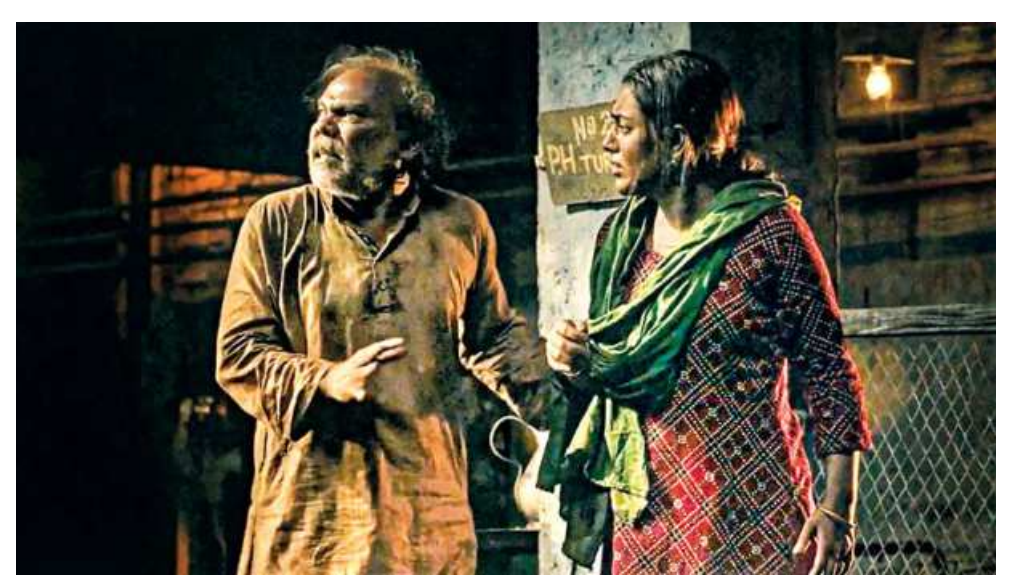
A still from "Khachar Bhitor Ochin Pakhi"

"I believe, the audience initially expected 'Khachar Bhitor Ochin Pakhi' to be a survival