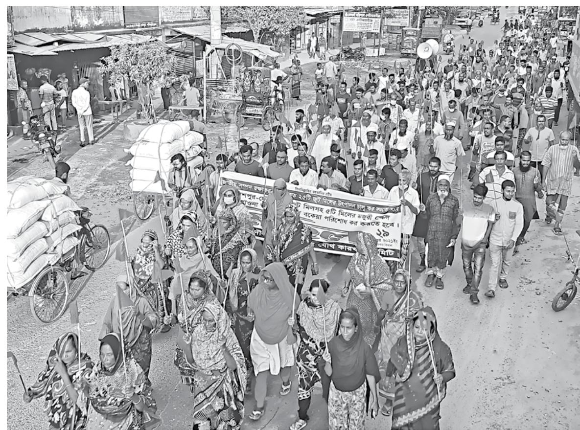
Jute mill workers brought out a red-flag procession on Khulna city's BIDC Road yesterday, demanding payment of their arrears according to the 2015 wage scale and reopening of five jute mills -- including Khalishpur and Daulatpur jute mills -- under government arrangement.

The arrested six are accused in several cases filed with different police stations for snatching, and possessing arms and drugs, Rab said.