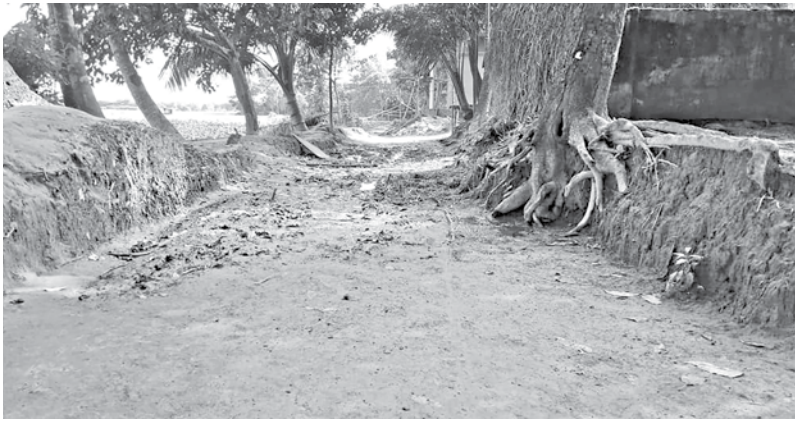
The Nalabaid to Nasirakanda road was dug up three years for development works. Today, it is in such bad condition that no vehicle can run on it, including rickshaws.

The estimated cost of the project is Tk 7.65 crore, he said.