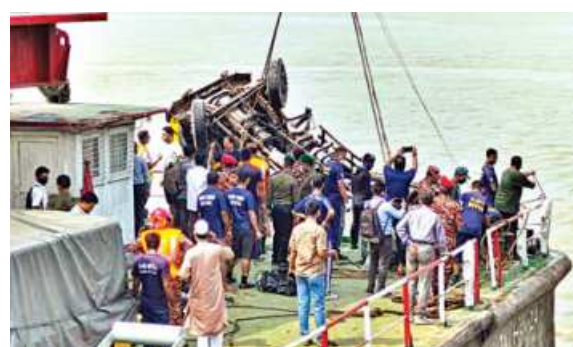
A rescue vessel pulling out vehicles which fell into the Padma river after a ferry tipped over on its side at Paturia terminal in Manikganj on Wednesday morning. Eleven of 18 sunken vehicles, including trucks and covered vans, were salvaged till last evening. Story on page 2.