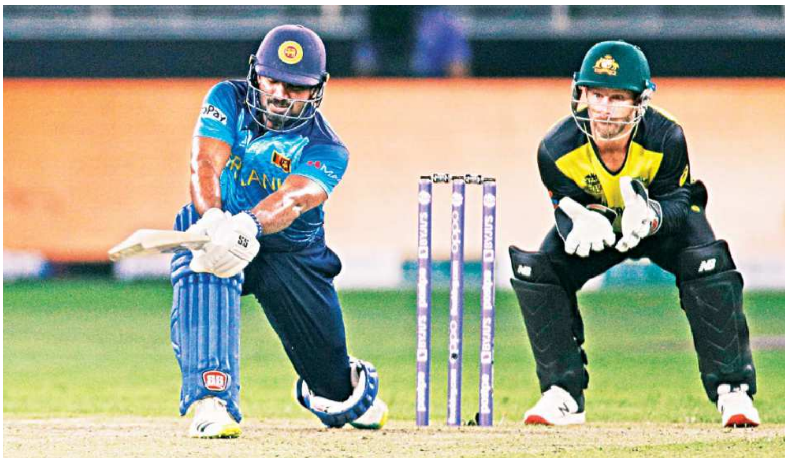
Opener Kusal Perera's 25-ball 35 helped Sri Lanka get off to a flying start before Australia bowlers bounced back in their Super 12 stage encounter of the T20 World Cup at the Dubai International Cricket Stadium yesterday.

La Liga Levante vs Atletico Madrid Live from 01:30 am (Saturday)