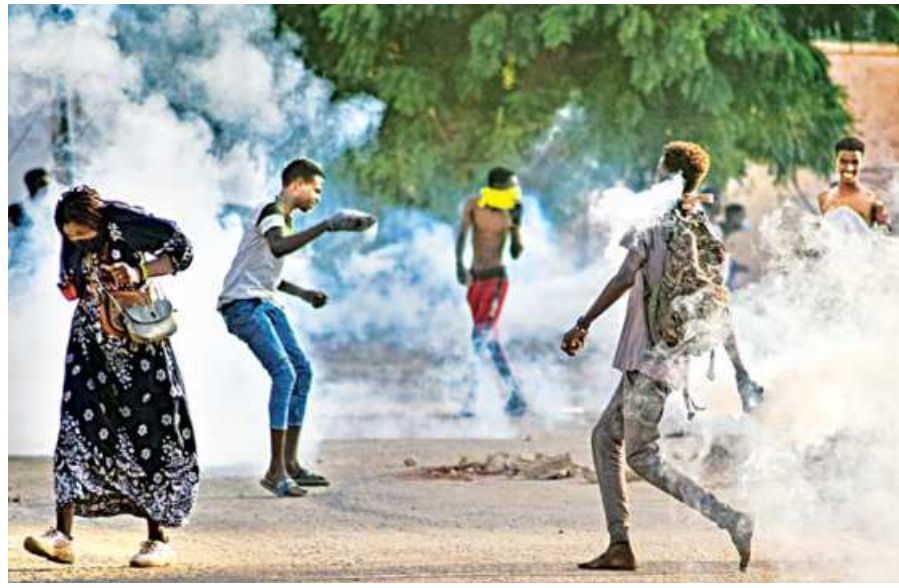
Sudanese youths confront security forces amidst tear gas fired by them to disperse protesters in the capital Khartoum. Photo was taken yesterday.