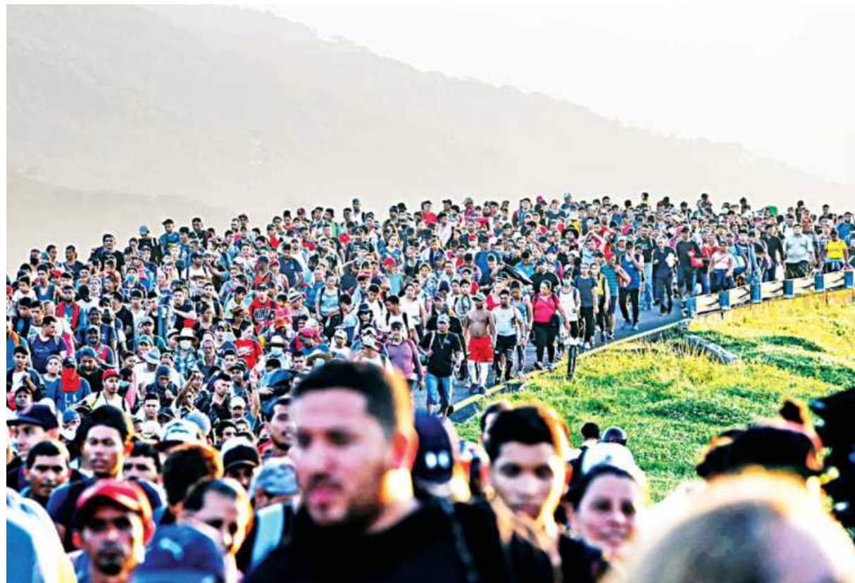
Migrants heading in a caravan to the US, walk towards Mexico City to request asylum and refugee status in Huixtla, Chiapas State, Mexico, yesterday. Around 1,000 migrants seeking refugee status are marching towards the Mexican capital, as the government faced a call by the UN to process the requests quickly.

Cambodia, next year's Asean chair, will keep pressure on Myanmar to stick to its agreement, its Foreign Minister Prak Sokhonn told Reuters yesterday, warning the country was on the brink of civil war.