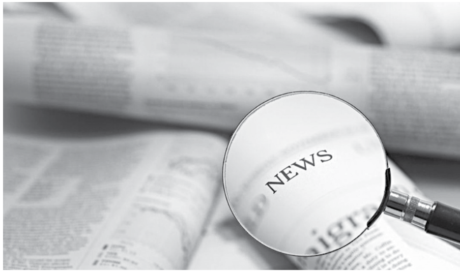
A functioning democracy requires an objective media.

As for the government, we are facing the same obstacles—perhaps a bit more severely—that the media in all new democracies face. After all, our struggle for democracy may have a long history, but our experience in practising it, save for the early years of liberation, is only 30 years old. Compared to governments of mature democracies, elected leaders in the new ones, including ours, suffer from all sorts of insecurities and are super-sensitive to every critical view, failing to even remotely grasp the logic of criticism as a cleansing process of governance. With the passage of time and growing differences, opponents in such democracies begin