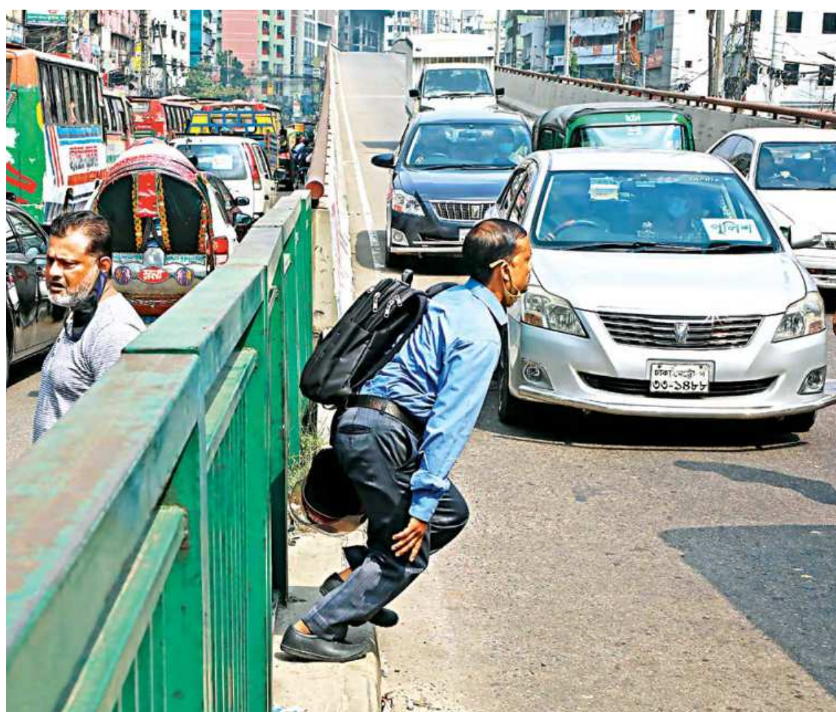
A man sneaks through a gap created in the divider on a busy road to cross to the other side. These man-made gaps, made and used so mindlessly, pose a risk to human lives. The photo was taken in front Habibullah Bahar College in the capital's Shantinagar yesterday.