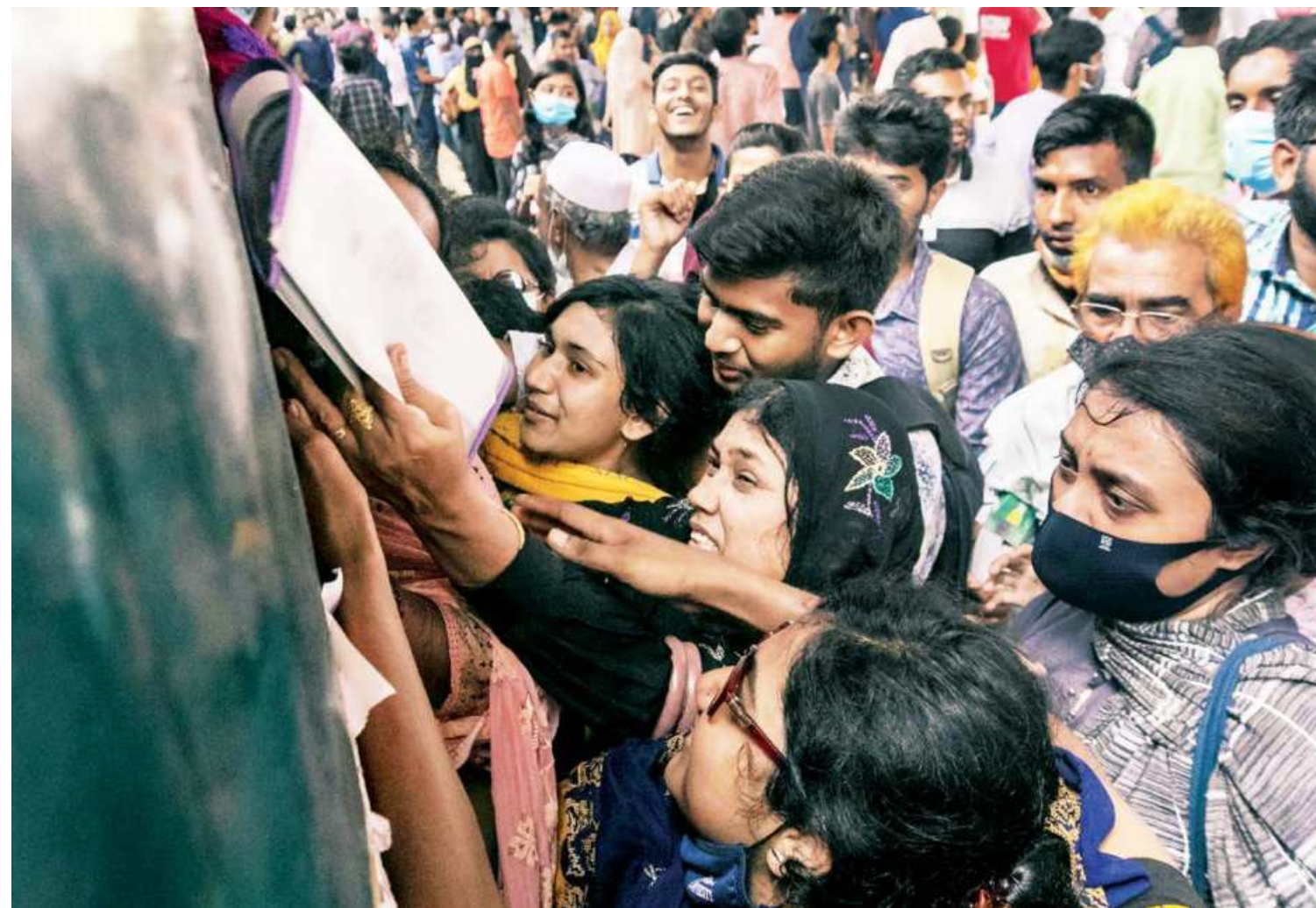
People, mostly students who just sat for the admission exams at Chattogram university, jostling to catch their train back home. While the Covid-19 pandemic is still prevailing around the world, health safety guidelines are hardly being maintained here. The photo was taken yesterday.