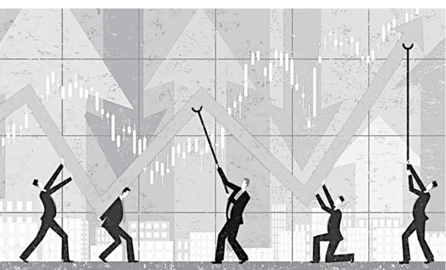
Good governance ensures sustainable development with low levels of corruption.

From all this information, one can easily conclude that if you have a strong democracy, you will have the lowest level of corruption and high-performing governance. At the same time, you will enjoy super human development status supported by strong tax justice. In Denmark, their tax justice is based upon progressive imposition of taxes on all citizens based on their income. As a