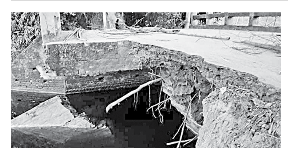
Part of a bridge on Korail-Hilora-Adabari road in Mohera Union Parishad under Mirzapur upazila of Tangail has recently collapsed, snapping road communication in the area and causing suffering to the commuters.