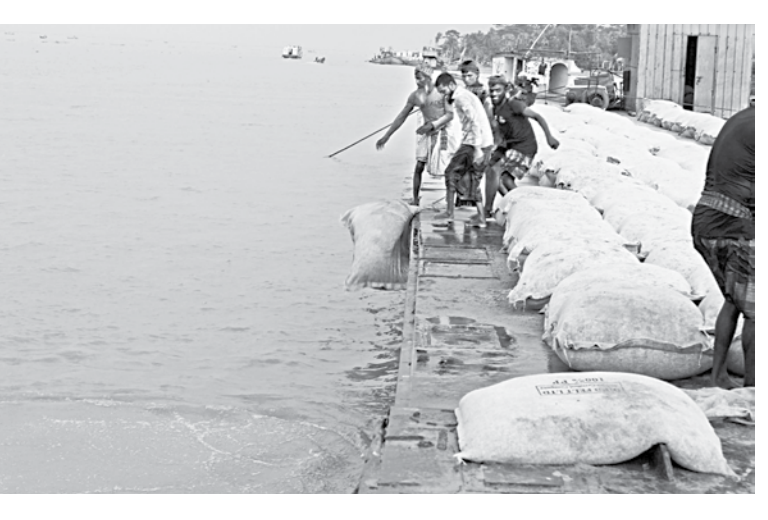
As part of a project launched recently to contain erosion of the Tentulia river, workers of BWDB dump geotextile bags in Dhulia area under Patuakhali's Baufal upazila.

The project includes 2.83 kilometres of excavation work in the Tentulia river.