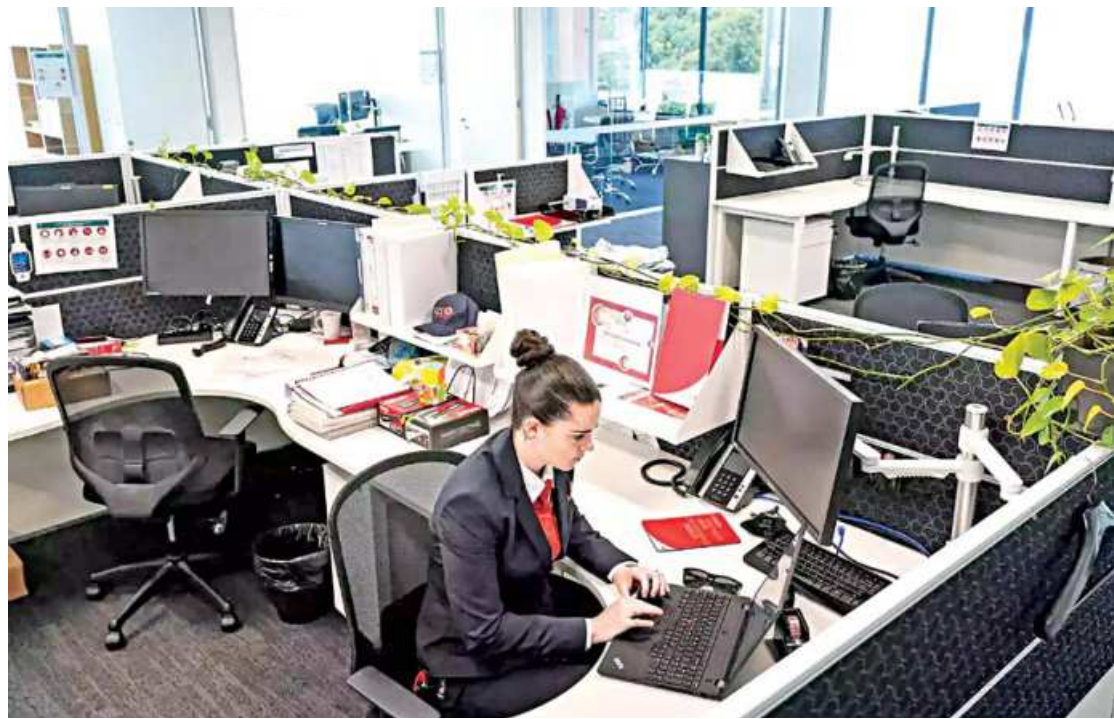
High-income countries fared better, suffering 3.6 per cent decline in total hours worked in the third quarter of this year, the ILO calculated.

In June, the ILO had been projecting a decline of 3.5 percent, or 100 million full-time jobs. High-income countries fared better, suffering 3.6 per cent decline in total hours worked in