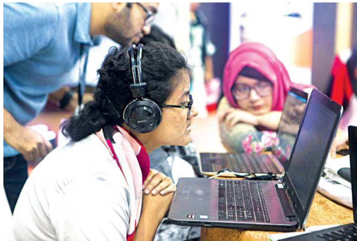
The government has set a target of $5 billion in export revenue by 2025 from software, IT-enabled services and digital devices.

A total of 100 awards will be conferred through step-by-step screening by judges in two categories. There will be 20 awards at the institutional level and 80 at