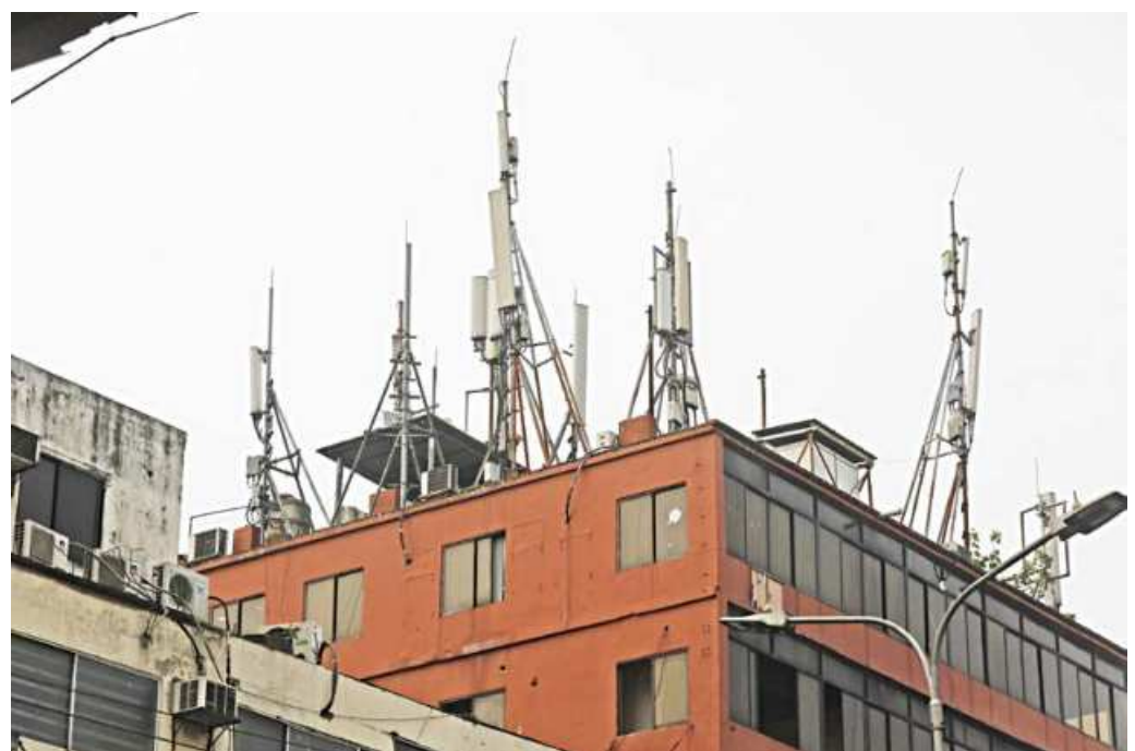
Robi, the second-largest mobile operator, will sell all of its 2,460 towers, while Banglalink, the third-largest, will sell 5,500 of its total 6,500 towers.