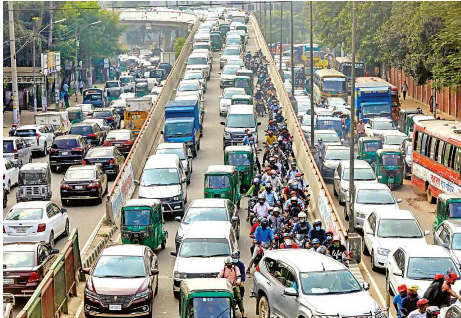
Vehicles stuck in long tailbacks on Moghbazar-Mouchak flyover and the road along it in the capital's Satrastra area yesterday. Commuters suffered major delays as two rallies organised in Nayapaltan and Shahbagh led to gridlock in different parts of the city.