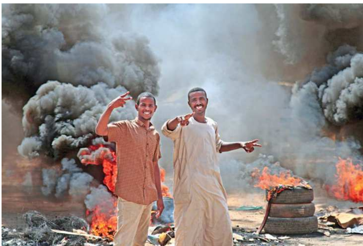
Sudanese demonstrators flash victory signs by a roadblock made of burning tyres in the capital Khartoum, yesterday, as they protest a military coup that overthrew the transition to civilian rule.

Meanwhile, Suu Kyi has denied a charge of incitement to cause public alarm, media reported yesterday, in her first court testimony since the February coup. Citing lawyers, BBC Burmese and Myanmar Now reported that Suu Kyi had denied incitement in connection with her party publishing a letter in February calling on international organisations not to cooperate with the junta.