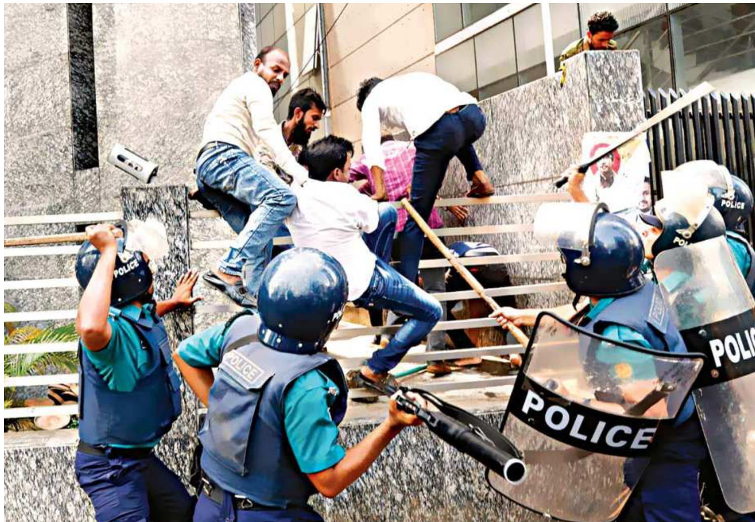
Police beat BNP activists with truncheons in the capital's Nayapaltan yesterday. The BNP men clashed with law enforcers after the party concluded a rally in front of its central office protesting the recent communal attacks. The clash left at least a dozen injured.