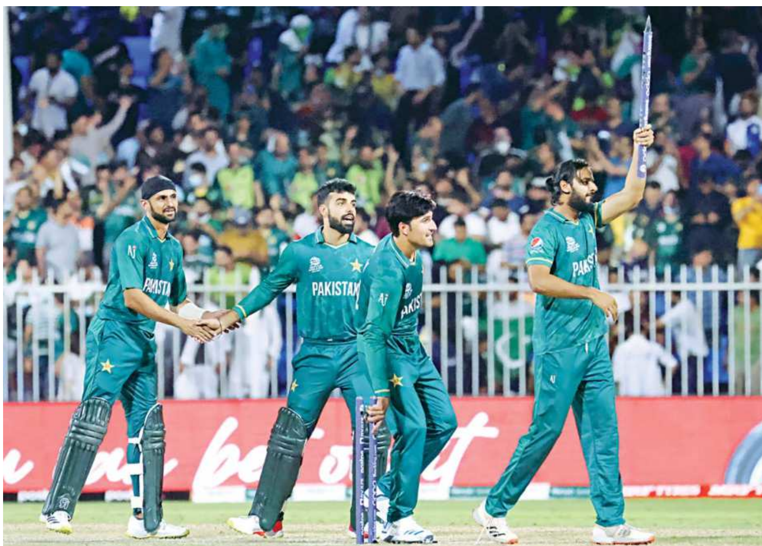
Pakistan players celebrate their five-wicket victory over New Zealand in their T20 World Cup Group 2 fixture at the Sharjah Cricket Stadium in Sharjah on Tuesday.