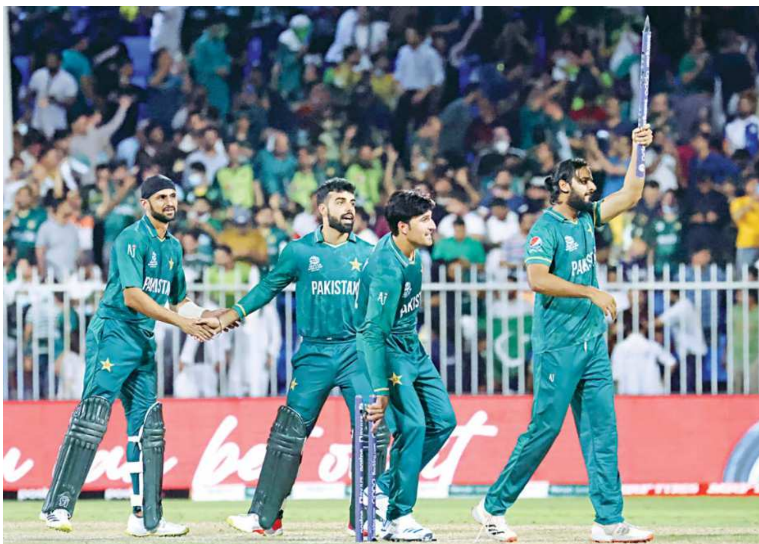
Pakistan players celebrate their five-wicket victory over New Zealand in their T20 World Cup Group 2 fixture at the Sharjah Cricket Stadium in Sharjah on Tuesday.