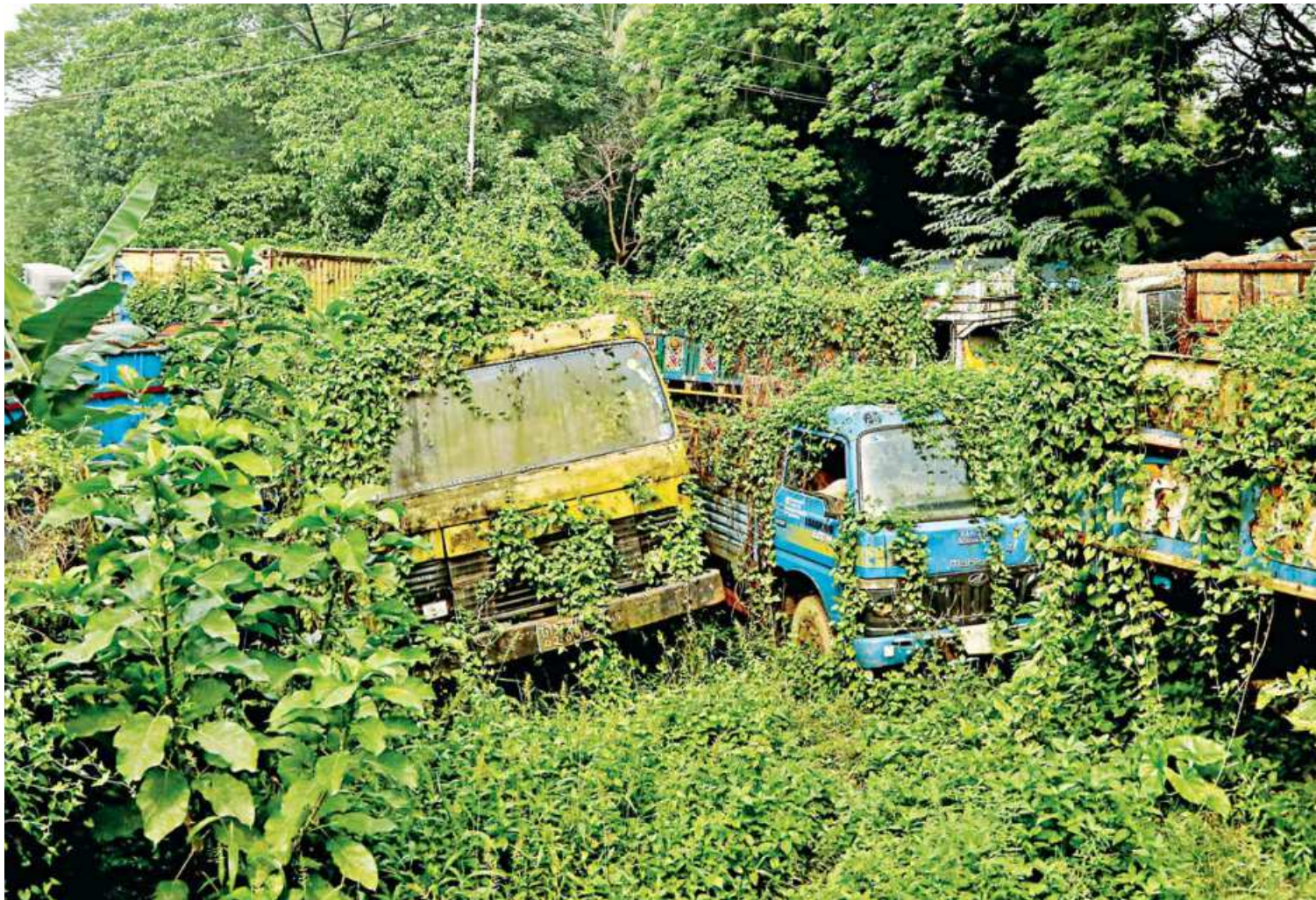
Heavy vehicles dumped by police, in an open area right behind the Shahbagh Police Control Room, have weeds growing in and around them. Due to a lack of maintenance after the dumping of around a hundred different vehicles, the place has turned into a jungle. The photo was taken yesterday.