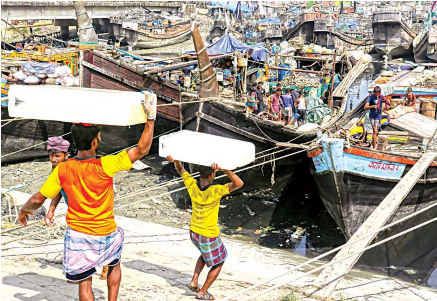
Fishermen carrying blocks of ice towards their boats to resume fishing after the 22-day long ban on Hilsa fishing ended last night. The photo was taken in Chattogram city's Fishery Ghat area yesterday.