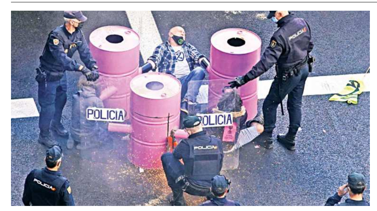
A Spanish police officer uses a radial saw to cut a barrel and remove a climate activist from the road during a protest by Extinction Rebellion against the COP26 summit in Madrid, Spain yesterday.

A former top Saudi Arabian spy has said the country's Crown Prince Mohammed bin Salman dispatched a feared team of mercenaries to kill him while in exile in Canada. In an interview with US broadcaster CBS News'"60 Minutes", Saad Aljabri -- formerly a top spy and interlocutor between the kingdom's intelligence services and Western governments -- alleged he was targeted after he fled the country following a 2017 power grab by the crown prince. A friend at a Middle Eastern intelligence service, he said, warned that he could face a fate similar to that of Saudi dissident and journalist Jamal Khashoggi, who investigations have alleged was murdered by a Riyadh-linked death squad after visiting the kingdom's consulate in Istanbul in 2018. "The warning I received, don't be in a proximity of any Saudi mission in Canada. Don't go to the consulate. Don't go to the embassy... You are on the top of the list," Aljabri told "60 minutes".