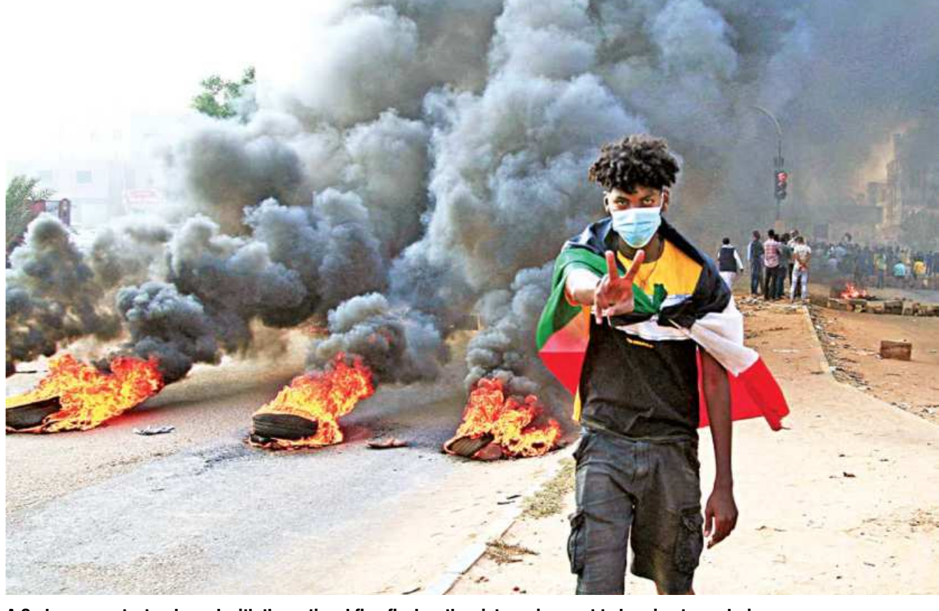
A Sudanese protester draped with the national flag flashes the victory sign next to burning tyres during a demonstration in the capital Khartoum yesterday, to denounce overnight detentions by the army of members of Sudan's government.

The food crisis, exacerbated by climate change, was dire in Afghanistan even before the takeover by the Taliban, whose new administration has been blocked from accessing assets held overseas as nations grapple with how to deal with the hardline Islamists.