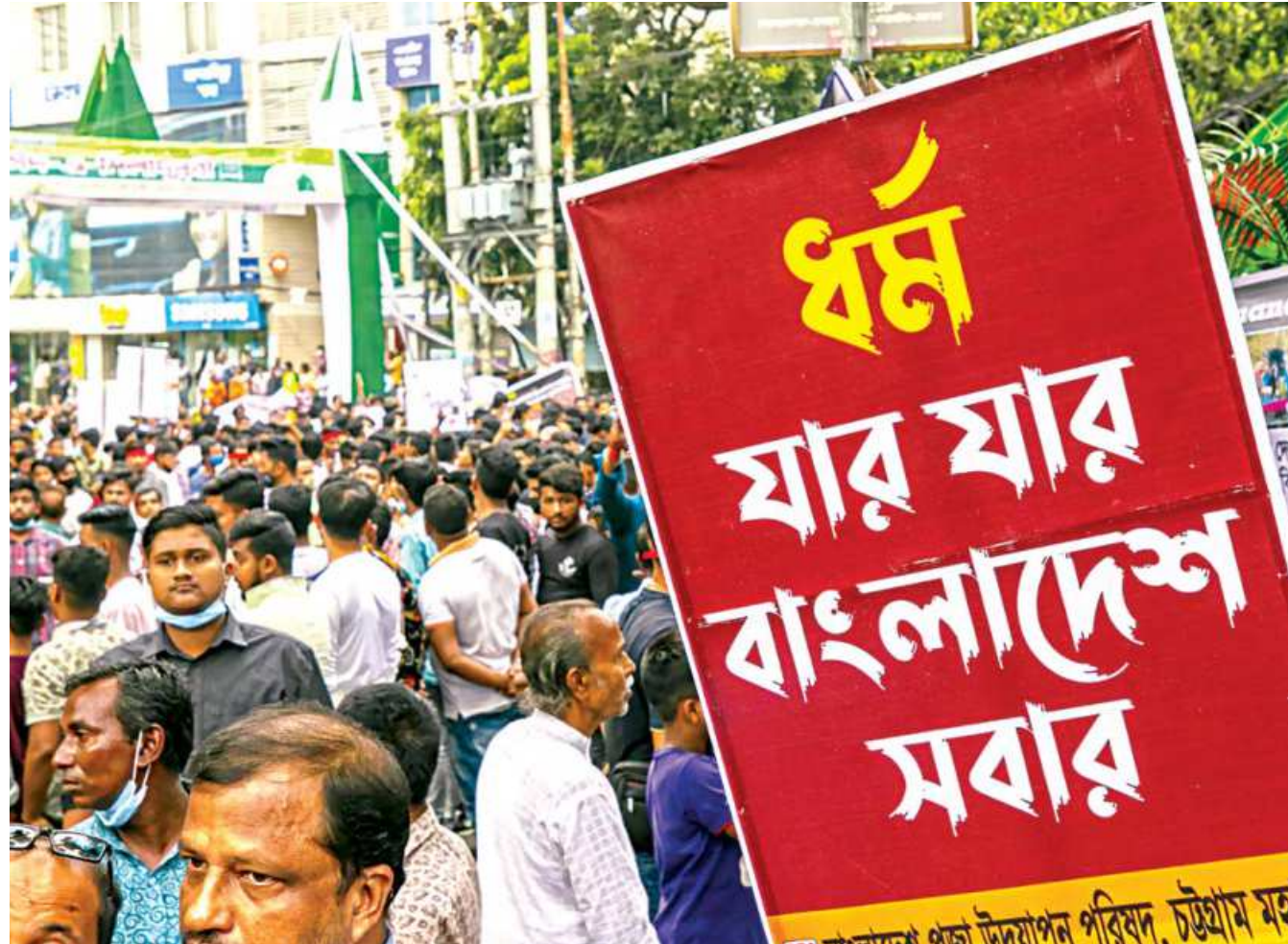
People attend a rally organised by Bangladesh Puja Udjapan Parishad in Chattogram city's Andarkilla area yesterday, denouncing the recent communal attacks on Hindu homes and temples in different places of the country. One of the placards carried to the protest read "Religion is for individuals; Bangladesh is for all". Story on page 3.