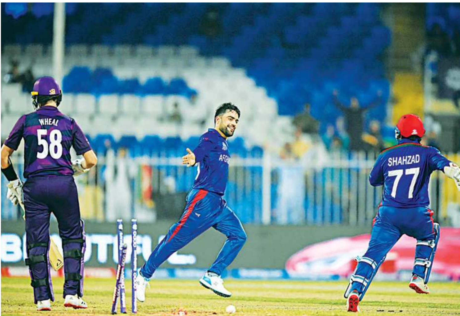
Afghanistan's spin wizard Rashid Khan (C) wheels away in celebration after dismissing Scotland's Brad Wheal (L) during their T20 World Cup match at the Sharjah Cricket Stadium yesterday. Rashid took four wickets while Mujeeb Ur Rahman scalped five as Afghanistan bowled out Scotland for 60 after having scored 190 to script a 130-run victory.