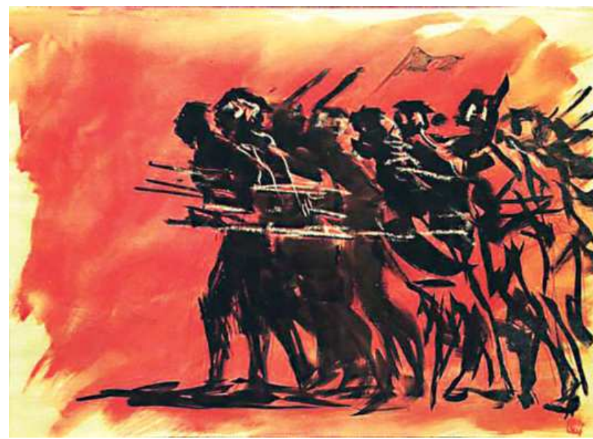
Painting by Zainul Abedin