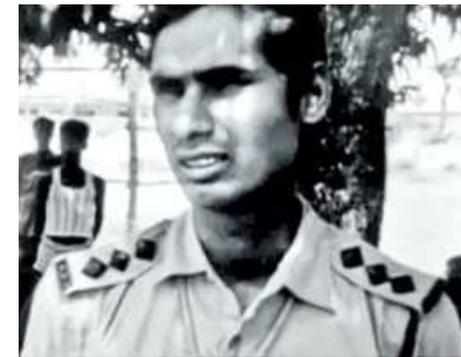
(L) Major General Muhammad Abul Manzoor Bir Uttam, Sector Commander of Sector 8. (R) Mahbub Uddin Ahmed Bir Bikram during the Liberation War.

Behind the scenes, higher-level activities had little or no perception to our foot soldiers or us. However, no operation was too dangerous as every soldier was ready for supreme sacrifice. Our prayers, vigil, gun barrels and smell of gunpowder were all aimed at killing the enemy. At times, both sides appeared tired of throwing bullets. In long monotony, the only respite was the intermittent bombardment. Between the cracking sound of wireless sets, we cried out for fire, seeing any movement on the enemy side. Our boys tried to hide untiringly in the trenches for hours without rest. The call of nature, occasional movement for ablution and other regular chores, and endless monotonous waiting, with or without some sleep, made it challenging to keep our location hidden.