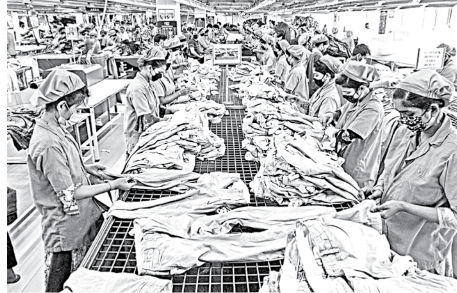
The proposals which have been submitted to the EU parliament for discussion, finalisation and decision, will have important implications for Bangladesh.