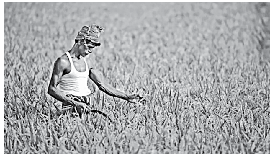
A farmer examines rice in a paddy field near a farmhouse in Dhaka.

low-cost initiatives can end hunger for 500 million people by 2030 while also limiting agricultural GHG emissions in line with the goals of the 2015 Paris climate agreement. These initiatives include agricultural research and development to produce food more efficiently, information services that provide farmers with weather forecasts and crop prices, literacy programmes for women—who account for almost half of small farmers in developing countries—