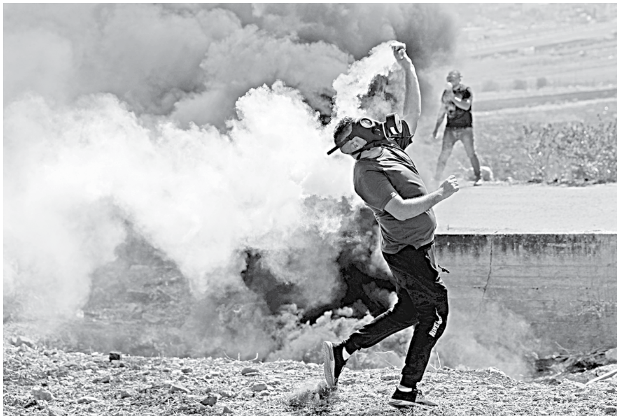
A Palestinian demonstrator returns a tear gas canister fired by Israeli troops, during a protest against Israeli settlements, in Beit Dajan, in the Israeli-occupied West Bank, yesterday.