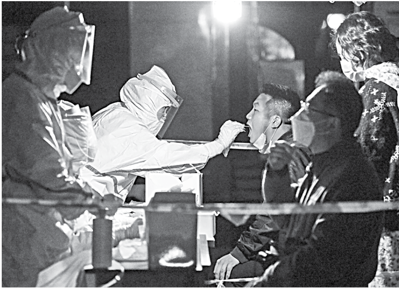
A medical worker in protective suit collects a swab from a resident at a makeshift nucleic acid testing site inside a residential compound, following new cases of the Covid-19, in Zunyi, Guizhou province, China, yesterday. Beijing plans to test tens of thousands of people after four new Covid-19 cases were found in a suburban district yesterday, as a new outbreak prompts school closures and flight cancellations across the country.

Rainforests are crucial for the environment because they serve as huge carbon sinks, but greenhouse gas emissions from burning and industrial-scale agriculture in the Amazon account for higher total annual emissions than those of Italy or Spain.