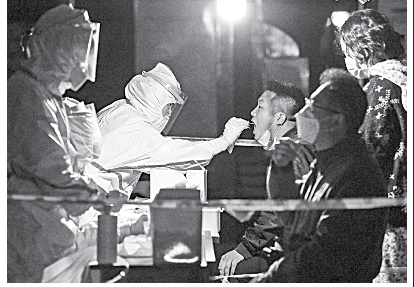
A medical worker in protective suit collects a swab from a resident at a makeshift nucleic acid testing site inside a residential compound, following new cases of the Covid-19, in Zunyi, Guizhou province, China, yesterday. Beijing plans to test tens of thousands of people after four new Covid-19 cases were found in a suburban district yesterday, as a new outbreak prompts school closures and flight cancellations across the country.

Rainforests are crucial for the environment because they serve as huge carbon sinks, but greenhouse gas emissions from burning and industrial-scale agriculture in the Amazon account for higher total annual emissions than those of Italy or Spain.