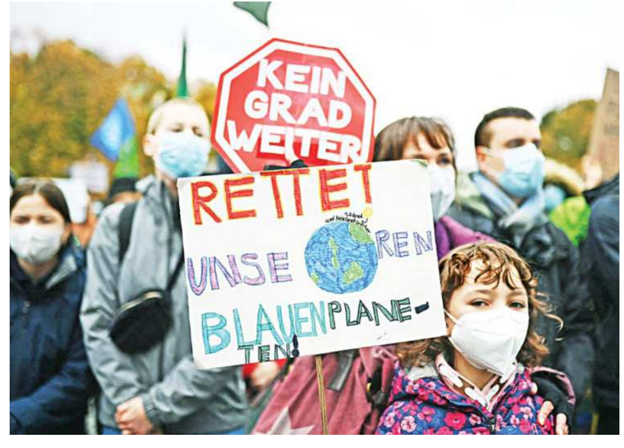
Activists march and hold cardboards reading "Save our blue planets" (bottom) and "Not one degree further" (top) during a climate strike demonstration of Fridays for Future at the Brandenburg Gate in Berlin, Germany yesterday.

of a big event. However, the players overcame that pressure and are all set to begin a new journey against bigger opponents.