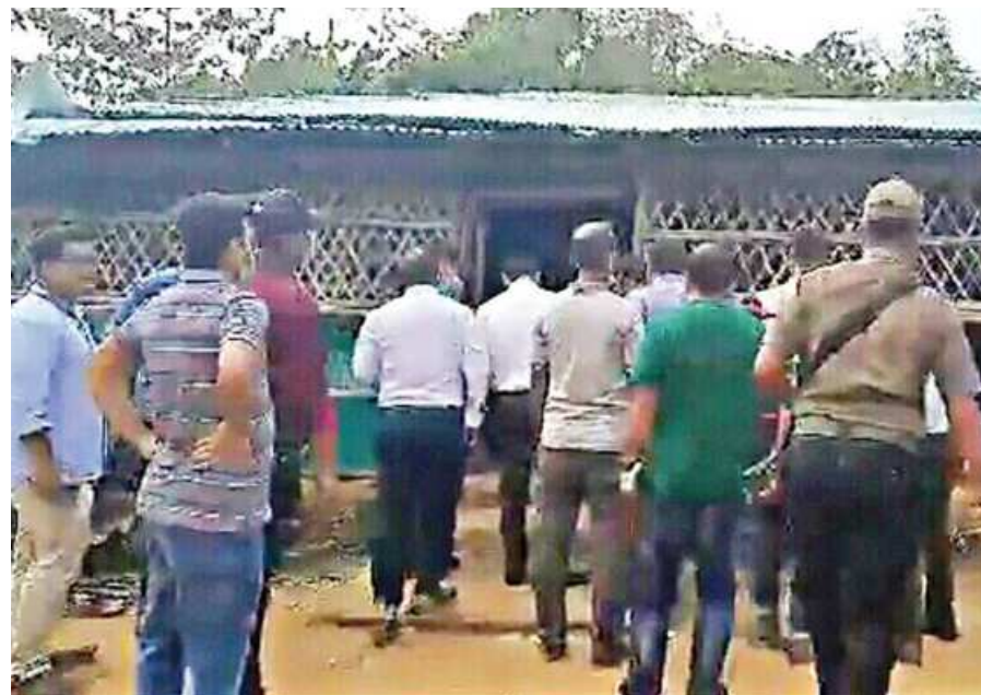
Local admin officials and volunteers visit the madrasa inside a Rohingya camp in Cox's Bazar's Ukhiya upazila yesterday, hours after unidentified criminals killed six Rohingyas there.