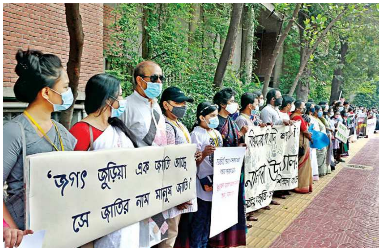
People form a human chain protesting the recent communal attacks on Hindus across the country. Renowned cultural organisation Chhayanaut organised the protest in front of its office in the capital's Dhanmondi yesterday. The protesters called for resisting communal forces.