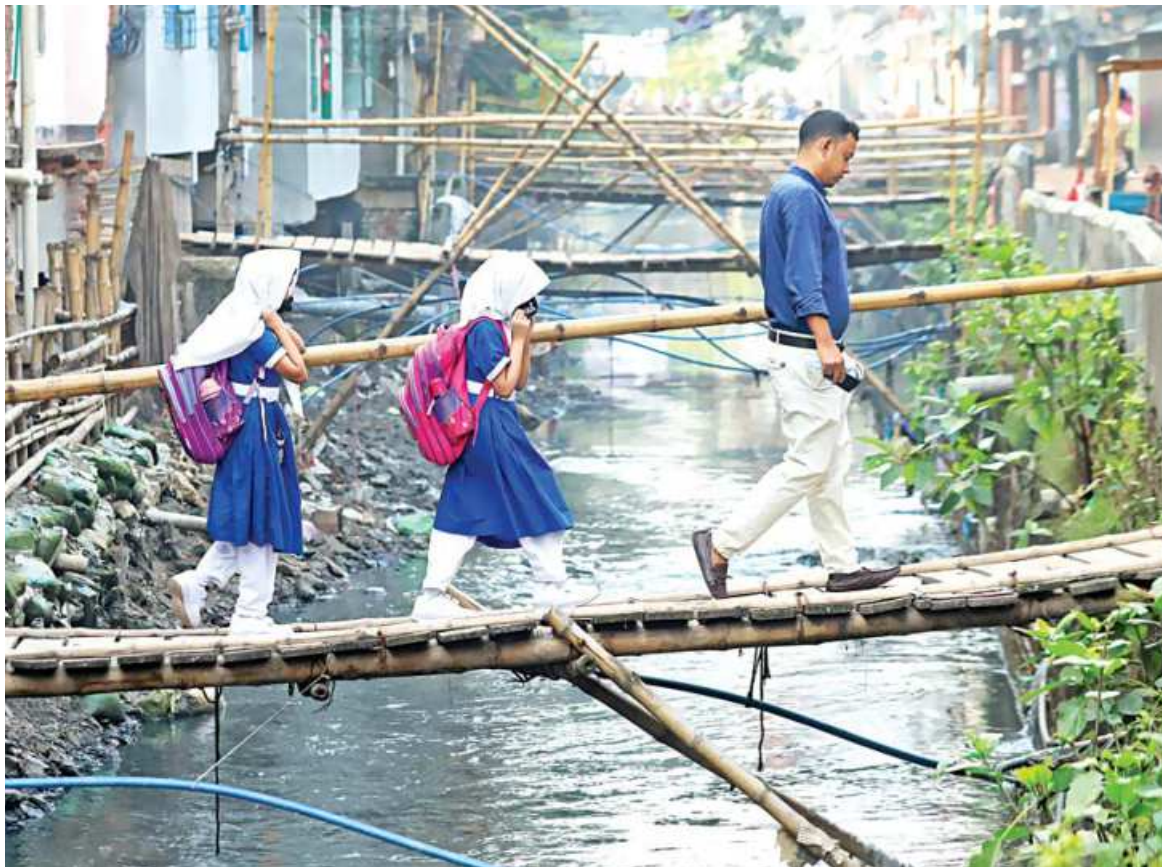
Two schoolgirls along with a man cross a bamboo bridge over the Bijoynagar canal in the capital's Manda. Residents of the houses along the canal have to put themselves in harm's way regularly as such bridges are the only way out of their abodes. The photo was taken recently.