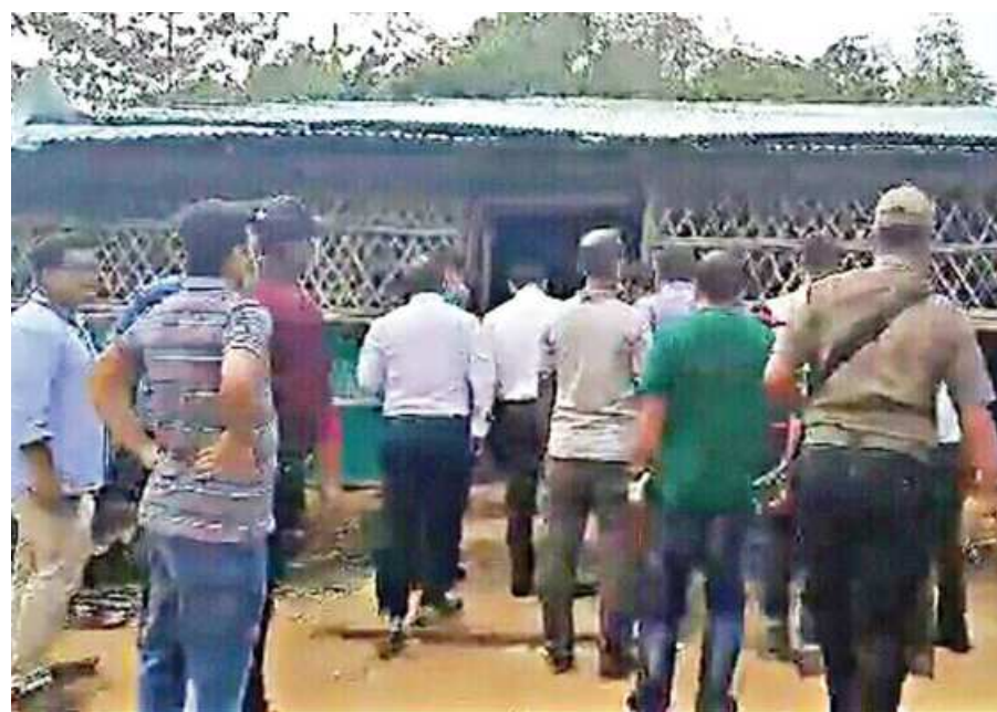
Local admin officials and volunteers visit the madrasa inside a Rohingya camp in Cox's Bazar's Ukhiya upazila yesterday, hours after unidentified criminals killed six Rohingyas there.