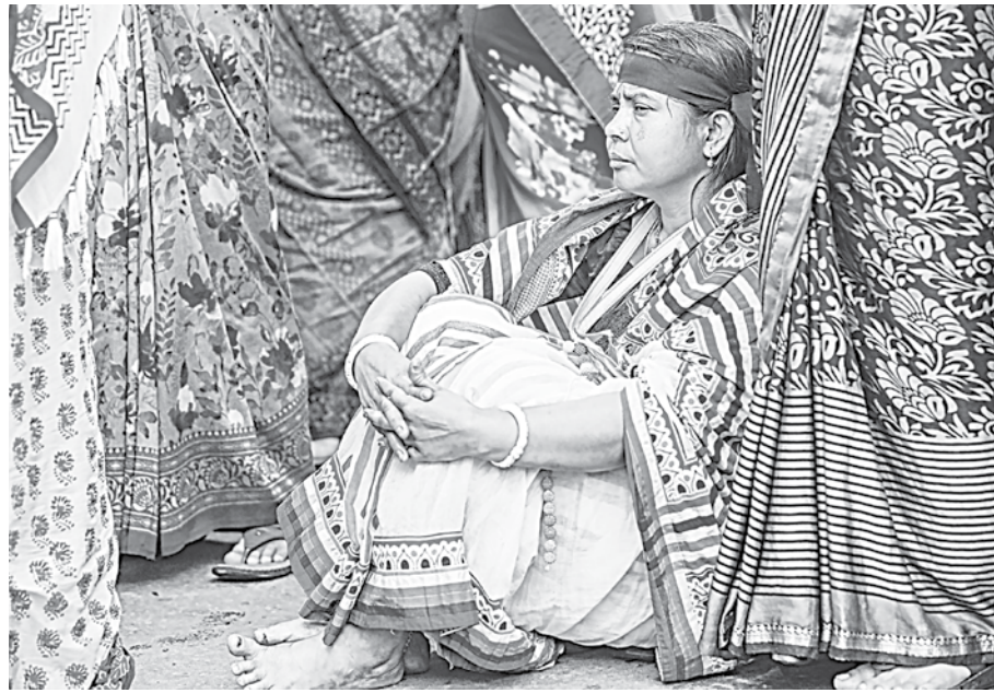
The fatigue on the face of this woman, during a protest in Dhaka against the latest spate of attacks on Hindus last week, is not just because of the stress caused by recent events, but also years of having to live in fear of losing everything to senseless hate.