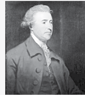
EDMUND BURKE (1729 - 1797) Irish statesman

Religious persecution may shield itself under the guise of a mistaken and over-zealous piety.