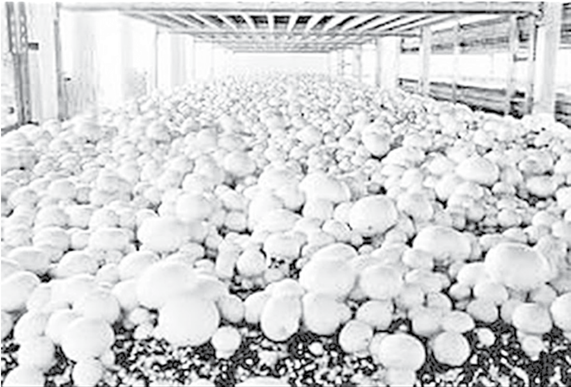
A view of a mushroom farm in Jashore.

“We have been waiting for six to seven years for the project to start