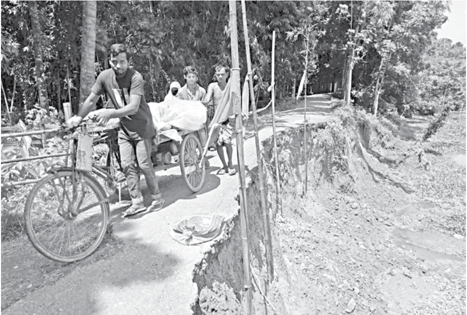
A man with the help of others pull a rickshaw-van, loaded with goods, on a road that was eroded away by the Kumar river in Faridpur Sadar upazila's Shobharampur village. As a means to caution road users, locals put up pieces of red cloths on bamboo poles along the edge of what is left of the road.

The cause of the problem lies in unplanned lifting of sand from the river by criminals, he also said.