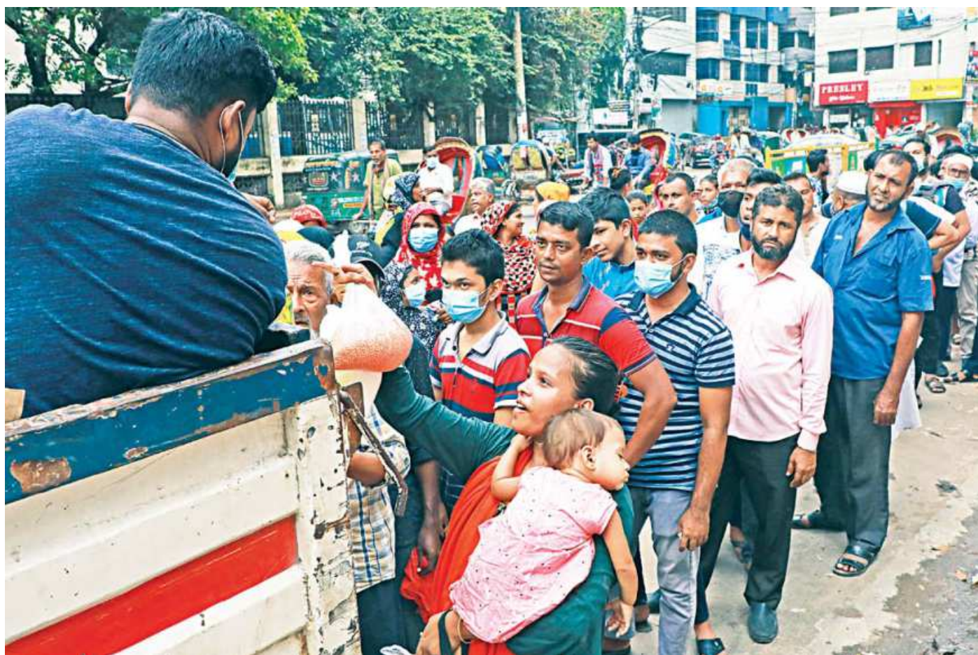
People with budget constraints are increasingly opting for food commodities being made available at subsidised rates by the Trading Corporation of Bangladesh (TCB) as prices have been spiralling at kitchen markets in recent weeks. As of October 14, soybean oil was priced at Tk 135 per litre in the open market while sugar Tk 79, lentil Tk 85 and onion Tk 60 per kilogramme. In contrast, the TCB is offering those at Tk 100, Tk 55, Tk 55 and Tk 30 respectively. The photo was taken in front of Matsya Bhaban in the capital yesterday noon.

This means as much as 40 per cent of the population in Bangladesh was living in poverty, up from 20.5 per cent before the