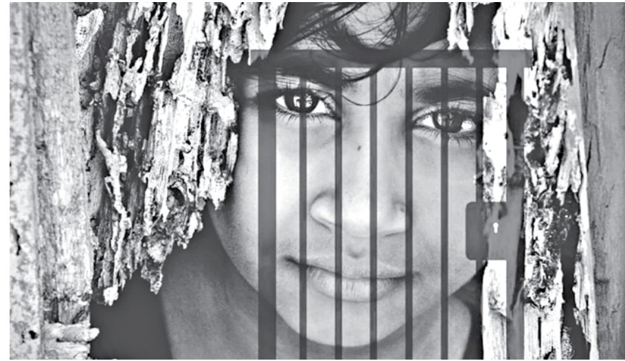
We should guarantee equal access to education and other opportunities that decrease the isolation of children with disabilities.