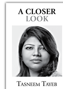
A CLOSER LOOK