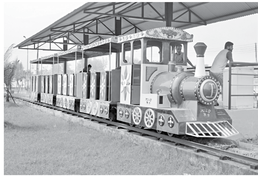
The 'Western Express Train' ride at Sheikh Russell Children's Park in Circuit House area of Patuakhali town. The amusement park was made open to public on October 12.

Although the construction work was completed exactly a year ago, on October 12, 2020, the park's formal opening was delayed due to the coronavirus situation.