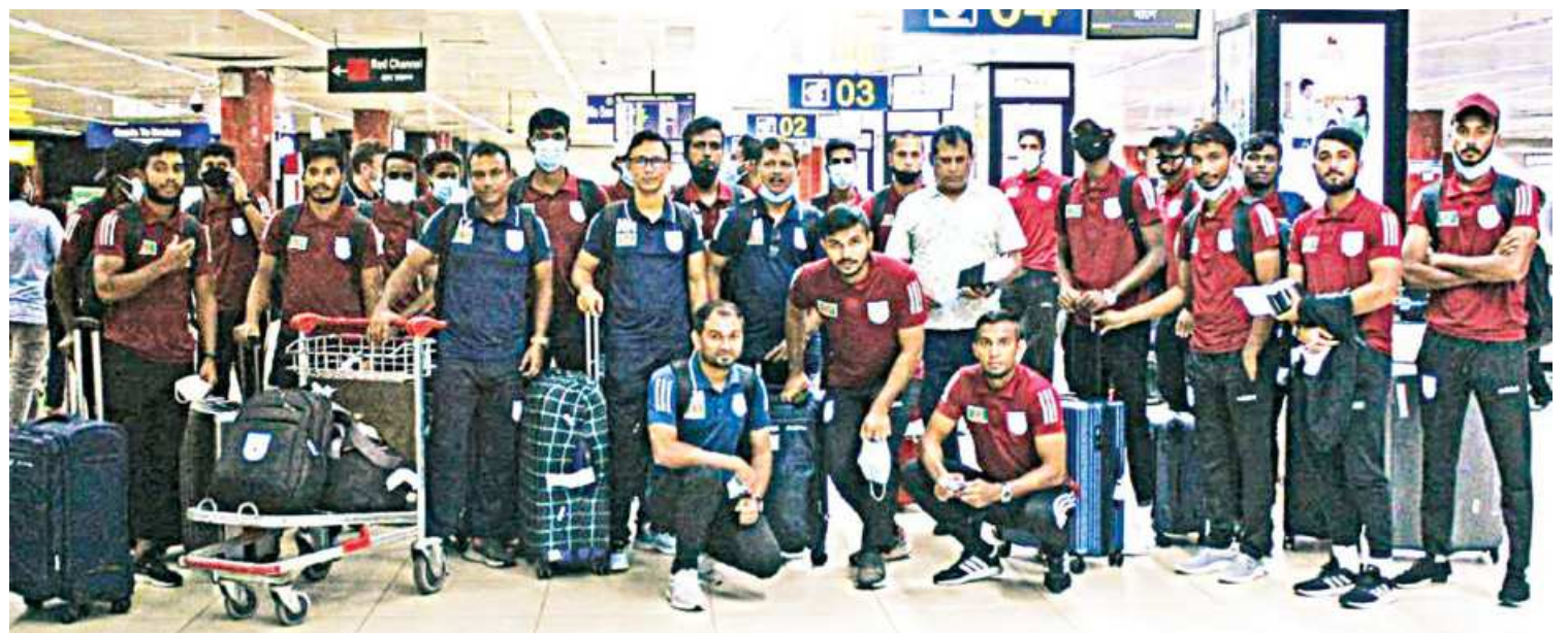
The Bangladesh national football team returned from Maldives yesterday following their SAFF Championship campaign, where they finished fourth on points among five teams. While a number of players from this squad will join the under-23 team's ongoing camp for this month's U-23 Asian Cup Qualifiers in Kuwait, the senior team's next assignment will be next month in Sri Lanka where they will play in a four-nation invitational tournament, also featuring hosts Sri Lanka, Maldives and Seychelles.

Salah's breathtaking goal stole the spotlight on a day when Roberto Firmino claimed his first Liverpool hat-trick since 2018 in his first start for five league games.