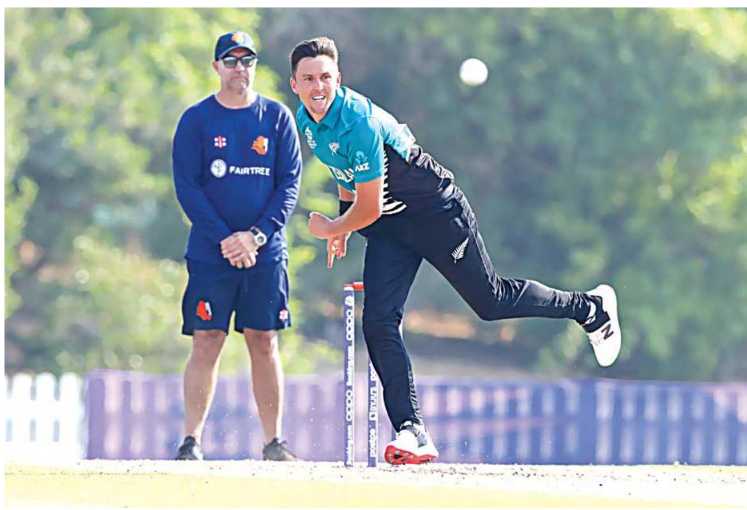
Trent Boult throws one down during an unofficial warm-up match against Netherlands at the ICC Academy Ground in Dubai yesterday. The Kiwis will play their first official practice match against Australia today before playing their first Super 12 match against Pakistan on October 26.

Solskjaer's men face Liverpool, Tottenham, Manchester City, Chelsea and Arsenal in their next six Premier League games.