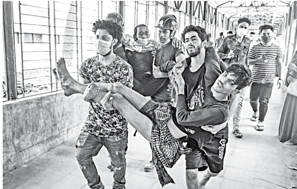
Six workers of SS Power I Plant in Banskhali, Chattogram were killed after police fired shots into their protests on April 17.