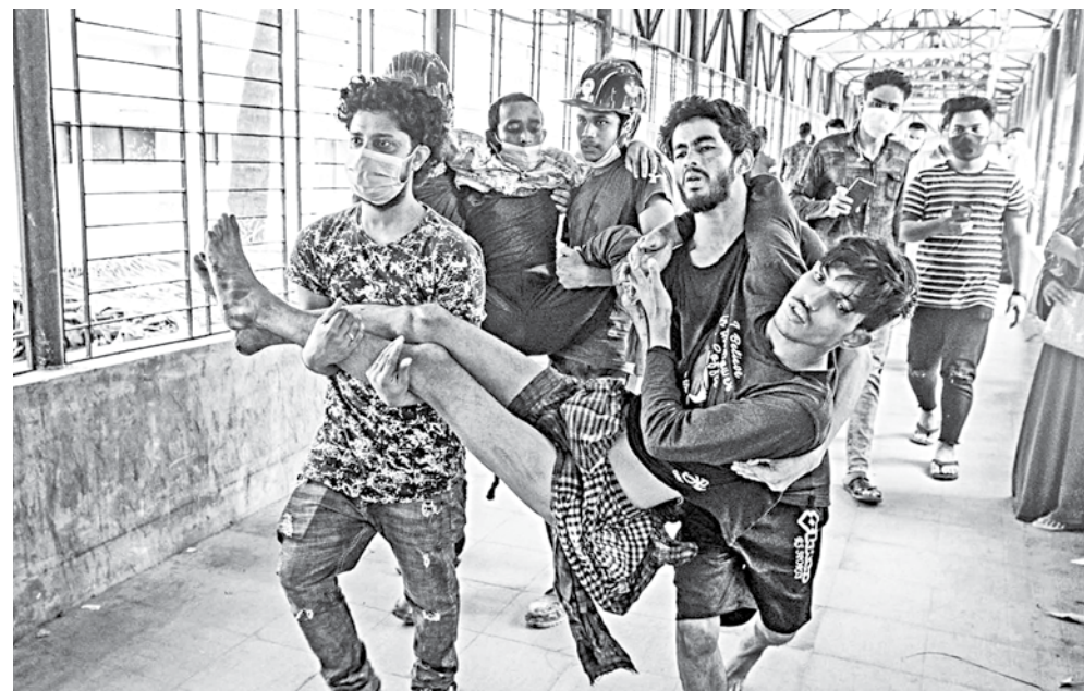
Six workers of SS Power I Plant in Banskhali, Chattogram were killed after police fired shots into their protests on April 17.