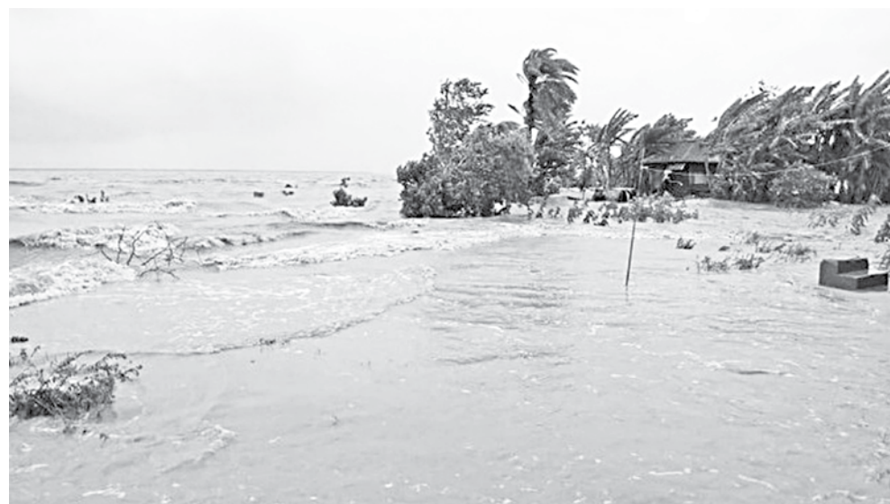
File photo of coastal areas in Patuakhali being inundated during cyclone Amphan.

This is why Asia and the Pacific must promote a new paradigm of economic development that can turn climate actions into drivers of economic growth that are