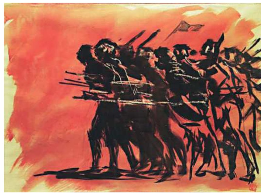
Painting by Zainul Abedin