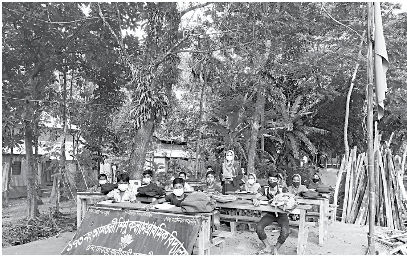
Students of Amtali Shishu Kalyan Primary School in Barguna's Amtali upazila attend classes under the open sky as their lone classroom collapses on Wednesday.